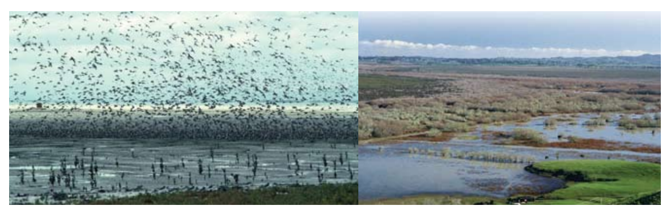
Waders, Acess Bay, Firth of Thames.

Along with a number of other countries, New Zealand was identified as a Contracting Party with potential future site nominations, and was also encouraged to update Ramsar Information Sheets (RIS<sup>7</sup>) for existing Ramsar sites.