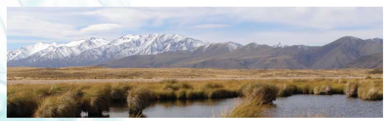
Carex secta swamp, Ashburton Basin.

... areas of marsh, fen, peatland or water, whether natural or artificial, permanent or temporary, with water that is static or flowing, fresh, brackish or salt, including areas of marine water the depth of which at low tide does not exceed six metres...<sup>3</sup>