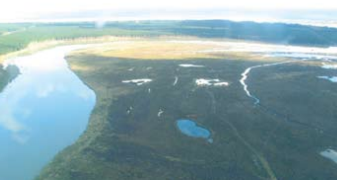
Manawatu Estuary.