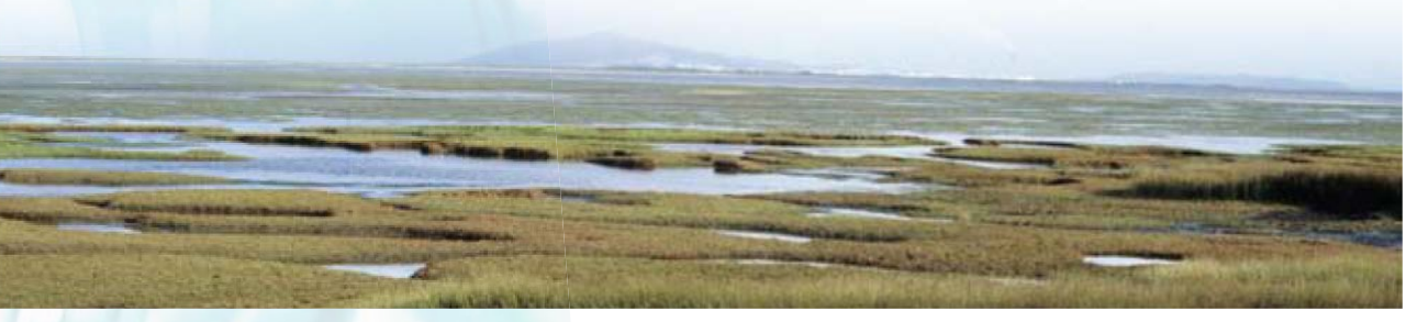
Wetland plants, Awarua Bay, Southland.