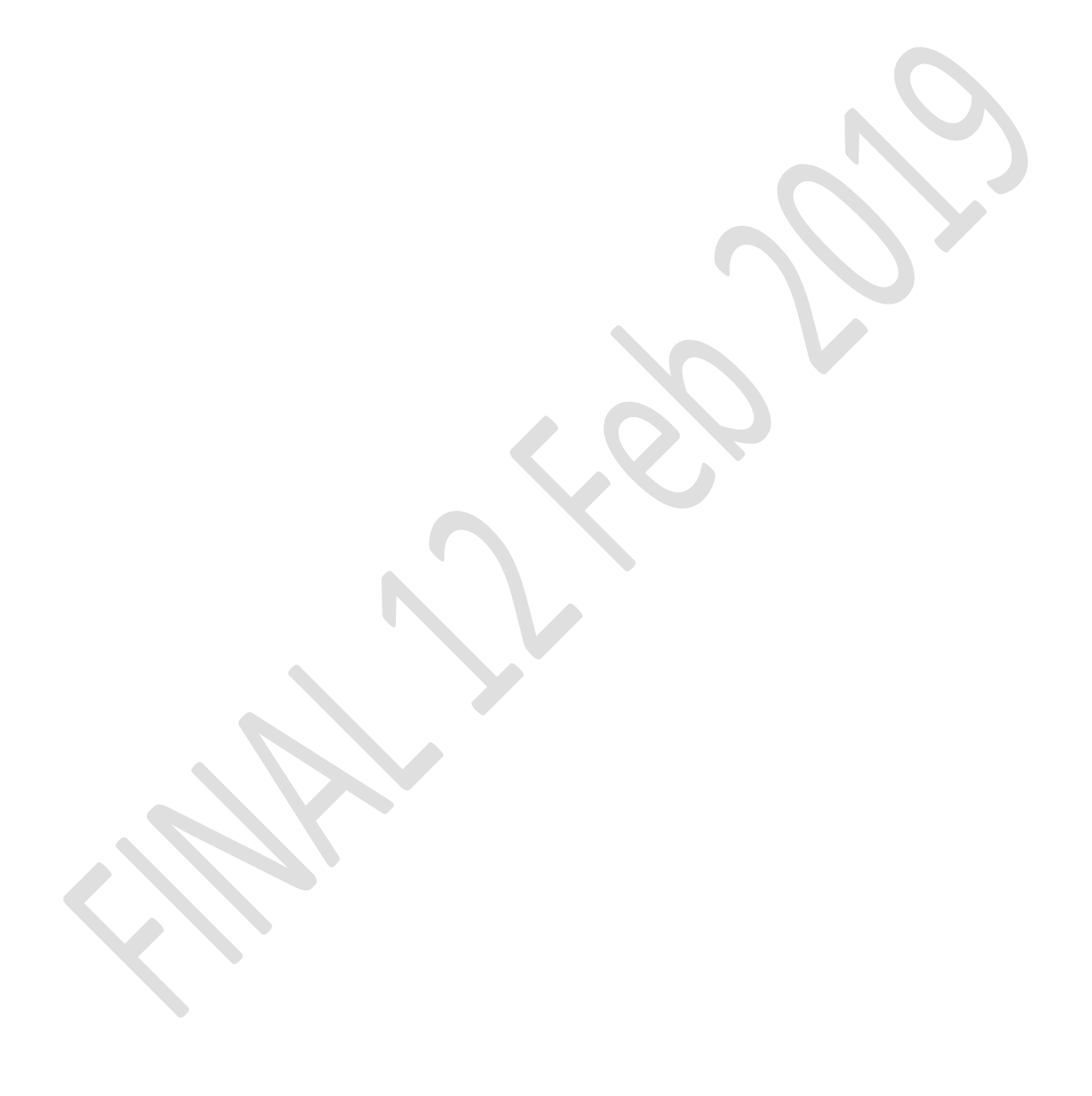
Appendix 5: Critical issues: engagement