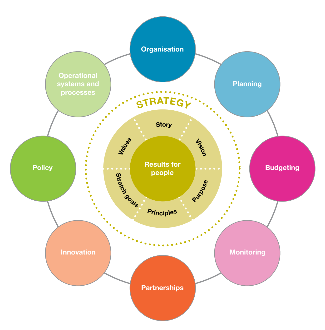
Figure 3: Elements of DOC's operating model.