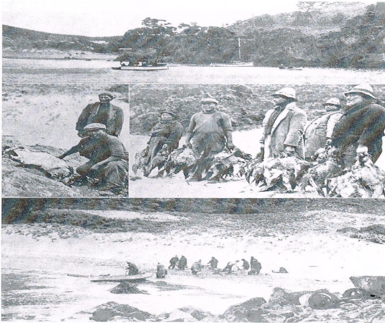
Muttonbirders on Whale Island in 1940.