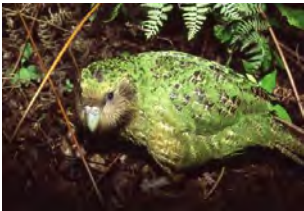
Location: Tahunanui School Hall, Nelson