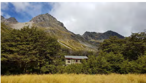
Location: Nelson Lakes National Park