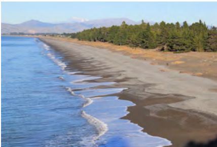
Location: South Marlborough