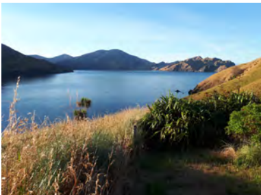
Location: D'Urville Island