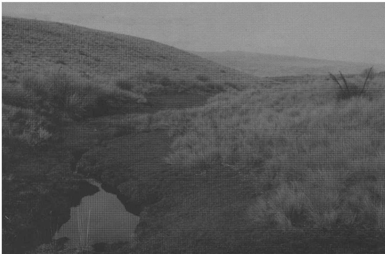
Figure 1 South Rough Ridge is the highest mountain range in the Manorburn Ecological District. Cushion vegetation and wetlands are characteristic of the range as is the pictured red tussock grassland with emergent Aciphylla aurea .

Keywords: Manorburn Ecological District, Lepidoptera, Cicadidae, Acrididae, species list, type localities, rare species, biogeography, saline soils, tors, alpine grassland, shrublands, key sites for conservation.