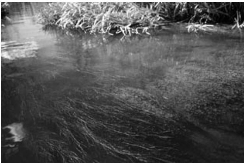
Fig. 17 Shallow water: a gently flowing river channel through a lowland swamp with submerged, bottom-rooted aquatic plants of pondweed ( Potamogeton pectinatus ) and starwort ( Callitriche petriei ), plus marginal floating foliage of giant sweetgrass ( Glyceria maxima ), Waipori River, Otago.