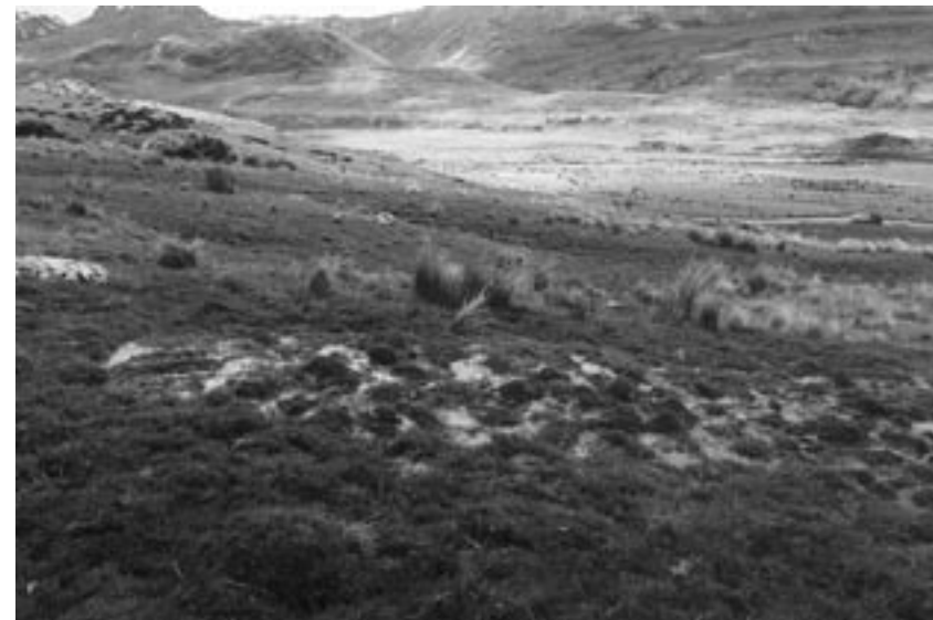
Fig. 16 Seepage: the toe-slope of a hillside with grazed sedgeland on a seepage carrying a moderate flow of groundwater and surface water, Greenstone Valley, Otago.

An area on a slope which carries a moderate to steady flow of groundwater, often also surface water, including water that has percolated to the land surface, the volume being less than that which would be considered as a stream or spring. Substrate ranges all the way from raw or well-developed mineral soil to peat; nutrient status and pH range from low to high; and the water table varies from just above the ground surface to a slight depth below. Seepages are located primarily where groundwater diffuses to the surface, especially at a change of slope, or where an impermeable basement raises the water table.