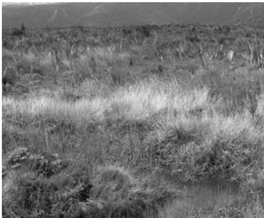
Fig. 13 Fen: a gently sloping fen with a mixture of wire rushland, tussockland, and flaxland at National Park, Mt Ruapehu, Volcanic Plateau.