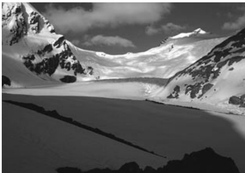
Fig. 11 Nival hydrosystem: snowfields at the head of the Whitbourn Glacier, Otago.