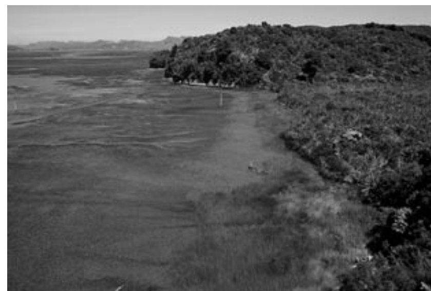
Fig. 6 Estuarine hydrosystem: zones of seagrass ( Zostera novazelandica ), sedgeland, and rushland saltmarsh, abutting onto palustrine flaxland, Whanganui Inlet, Nelson.