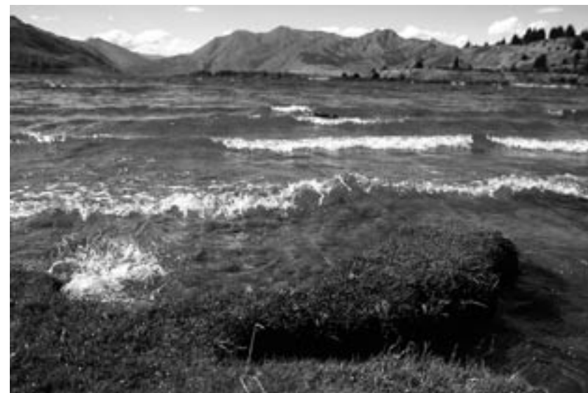
Fig. 5 Lacustrine hydrosystem: wave action upon lake margin turf, Lake Wanaka, Otago.

The plutonic hydrosystem includes all underground waterways and water bodies where light levels are too low to permit photosynthetic activity, and hence plant production, but where other inputs of energy allow for communities of fungi, microbes, insect larvae, and some fish species. Plutonic wetlands occur mainly as caves and underground streams in karst terrain (limestone and marble), but also as caves in volcanic lava, and as aquifers. Details of this hydrosystem are not further considered in this book.