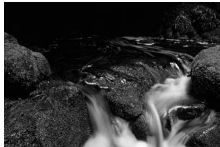
Fig. 9 Plutonic hydrosystem: represented here by a stream exit from a limestone cave, Oparara, Buller.