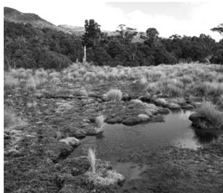
Fig. 12 Bog: a cushion bog with tussocks, a pool, and surrounding shrub and tree bog, Gorge Plateau, south Westland.

Wetland classes fit beneath hydrosystems (Table 1). Most wetland classes can occur within more than one hydrosystem, and indeed some will actually span a hydrosystem boundary at particular sites. The wetland classes are described below in no particular order.