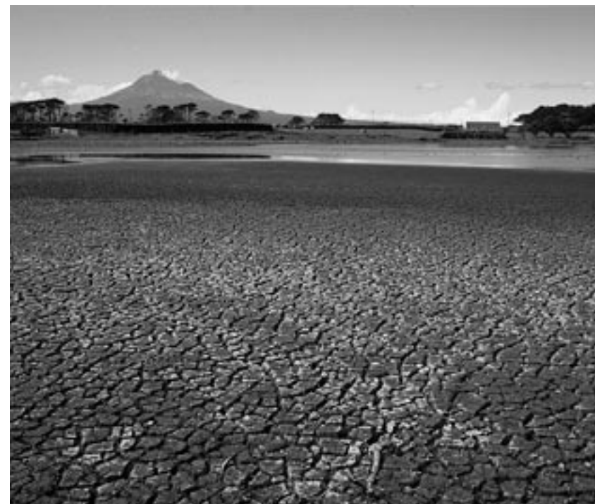
Fig. 18 Ephemeral wetland: the summer-drying phase of Julian's Pond, Taranaki.

Aquatic habitats, generally less than a few metres deep, having standing water for most of the time. This wetland class accommodates the margins of lakes, rivers, and estuary waters, in which case the term 'shallow open water' is sometimes used to acknowledge the presence of an open body of water further from the shore. This wetland class also encompasses bodies of water that are not sufficiently large or lake-like in character to warrant lacustrine classification, yet of greater significance than just as water body forms contained within a wetland. The dominant unifying determinant is the presence of standing water. Nutrient and water chemistry factors are basically those of the water, rather than the substrate. In practice, the shallow water wetland class provides for habitats that 'land-based' wetland workers would meet with at land / water margins. For purposes of mapping or categorising fully aquatic habitats of lacustrine or riverine hydrosystems, the term 'deep open water' is available as an additional wetland class.