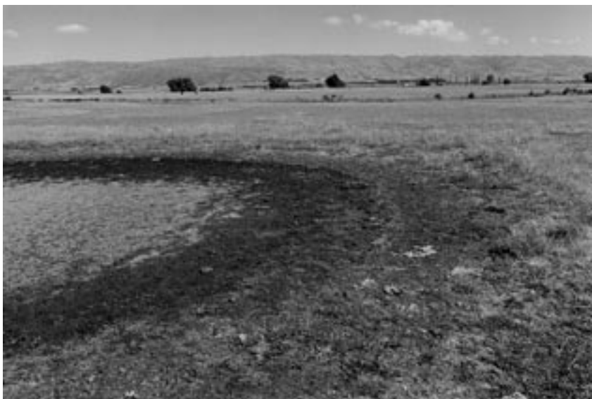
Fig. 8 Inland saline hydrosystem: a partly dried salt pan, Maniototo basin, Otago.