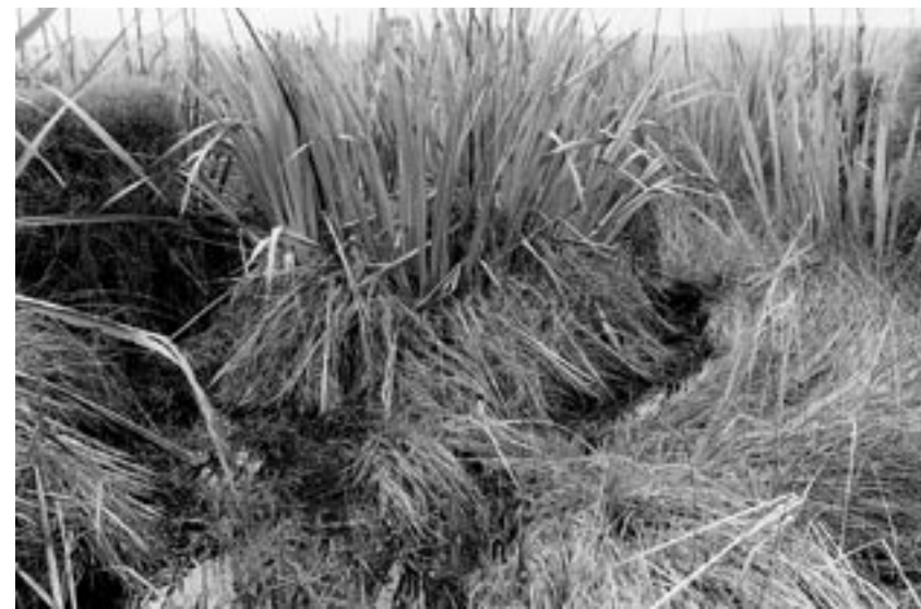
Fig. 14 Swamp: a flax ( Phormium tenax ) - Coprosma propinqua / Carex geminata sedge swamp with leads of open water and indications of a fluctuating water level, Maher Swamp, Westland.

Fens have slightly higher nutrient status than bogs, often because they occupy slight slopes, such as fans or the toes of hillsides (see Fig. 24) where they may grade downslope to swamp. Fens also occur on level ground where relatively shallow peat has not accumulated much above the influence of underlying mineral substrate, including situations around the margins of domed bogs. Fen vegetation is often composed of sedges, restiads, ferns, tall herbs, tussock grasses, or scrub.