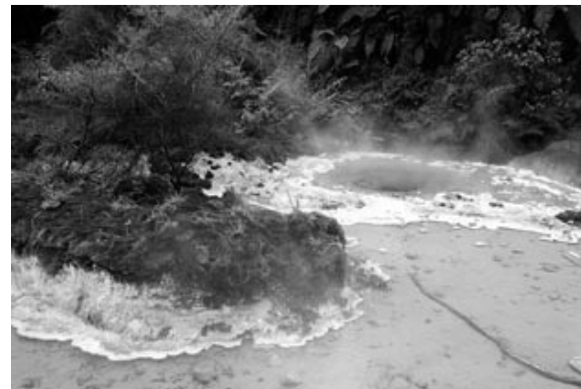
Fig. 10 Geothermal hydrosystem: a steamy fumarole as a stream source, Waimangu Stream, Rotorua.