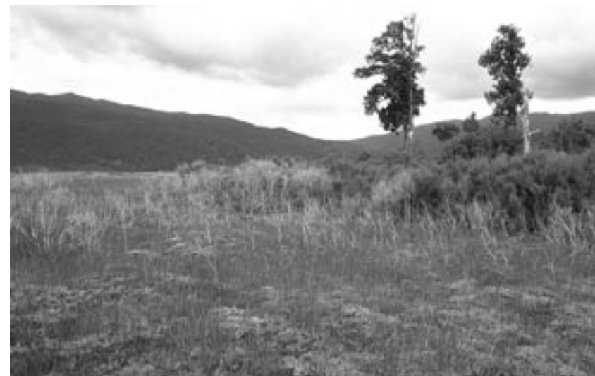
Fig. 19 Pakihī and gumland: represented here by the pakihī on German Terrace, near Westport, Buller, having typical fire-affected scrub of manuka ( Leptospermum scoparium ), and resprouting sedges and tangle fern ( Gleichenia dicarpa ).

A wetland class embracing estuarine habitats of mainly mineral substrate in the intertidal and subtidal zones, but also including those habitats in the supratidal zone (such as wet coastal platforms) and in the inland saline