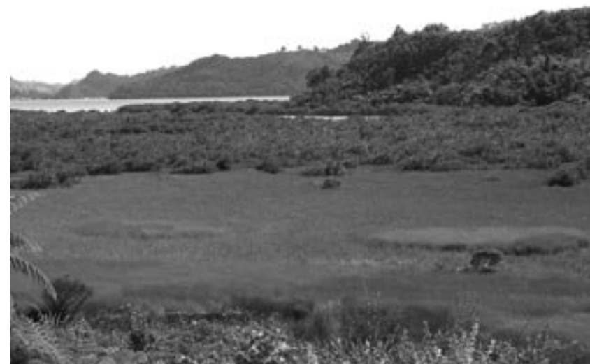
Fig. 20 Saltmarsh intertidal zones of mangrove ( Avicennia marina subsp. australasica ) scrub, and rushlands of sea rush ( Juncus kraussii subsp. australiensis ) and oioi ( Apodasmia similis ), Whitianga, Coromandel Peninsula.