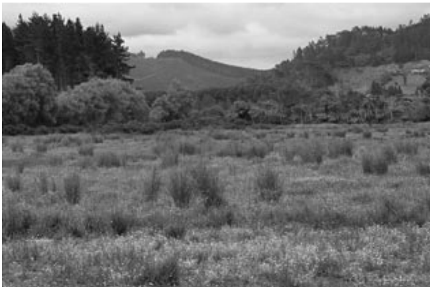
Fig. 15 Marsh: a valley floor marsh with rush clumps, grasses, and herbfield, near Waihi Beach, Bay of Plenty.

are usually mesotrophic to eutrophic, and slightly acid to neutral in pH. Marshes differ from swamps by having better drainage, a generally lower water table, a usually more mineral substrate, and a higher pH.