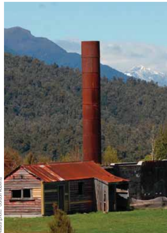
Waiuta