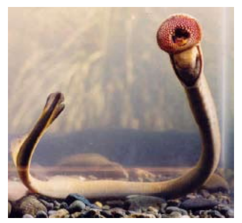
FIGURE 5. AN ADULT NEARING SEXUAL MATURITY. COMPARE THE BROWN COLOURATION WITH THAT OF FIGURE 1.