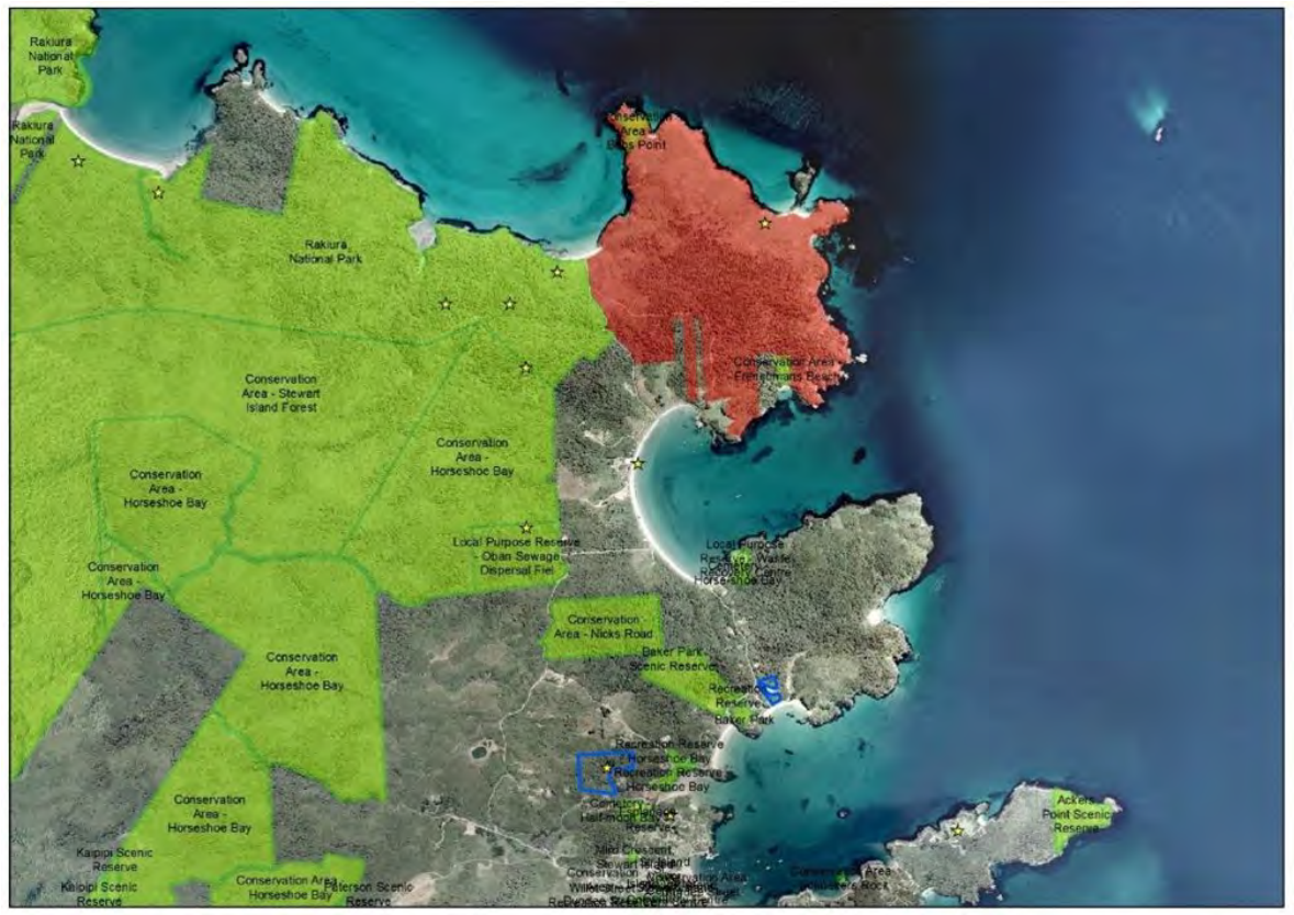
Figure 2: Aerial photograph showing the location and protection status/land tenure of habitats near MPCR (shown in red). DOC land is shown in green. QEII covenants are outlined in blue. Stars = known archaeological sites.