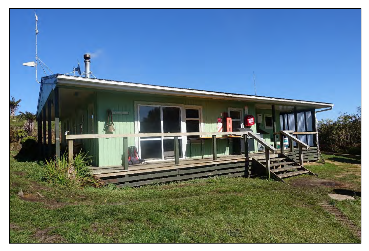
Figure 4: Environmental education centre facilities at MPCR.