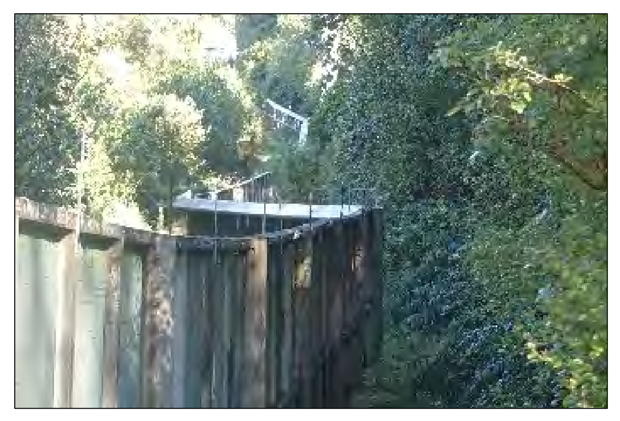
Figure 3: Predator proof fence along the western boundary of MPCR.