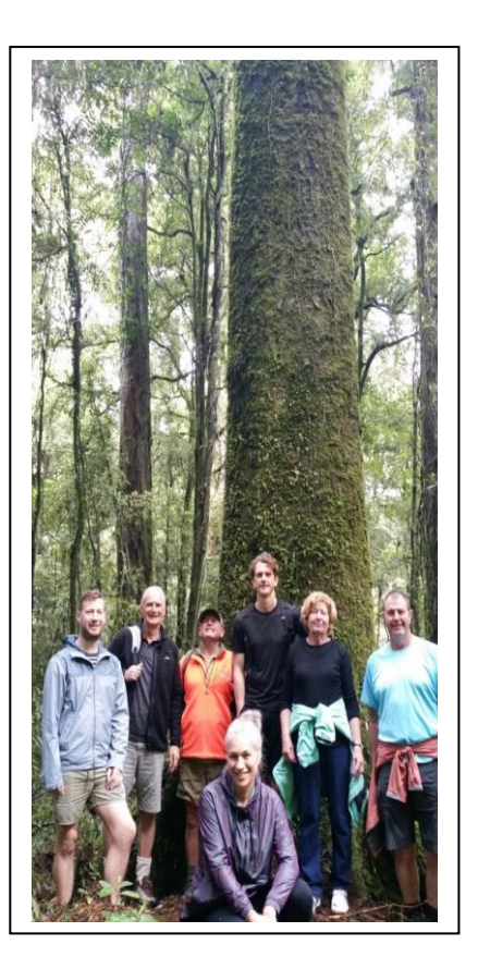
Left to Right: Pureora Forest – Waikato Conservation Board / DOC – December 2018

Other matters discussed included ongoing resourcing, increasing visitor numbers to the region, and impact on biodiversity and infrastructure.