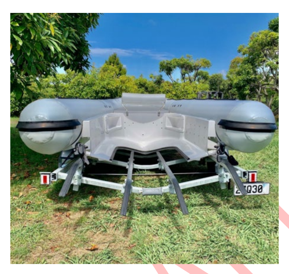
Figure 1 Rear view of Sealver without Jet Ski