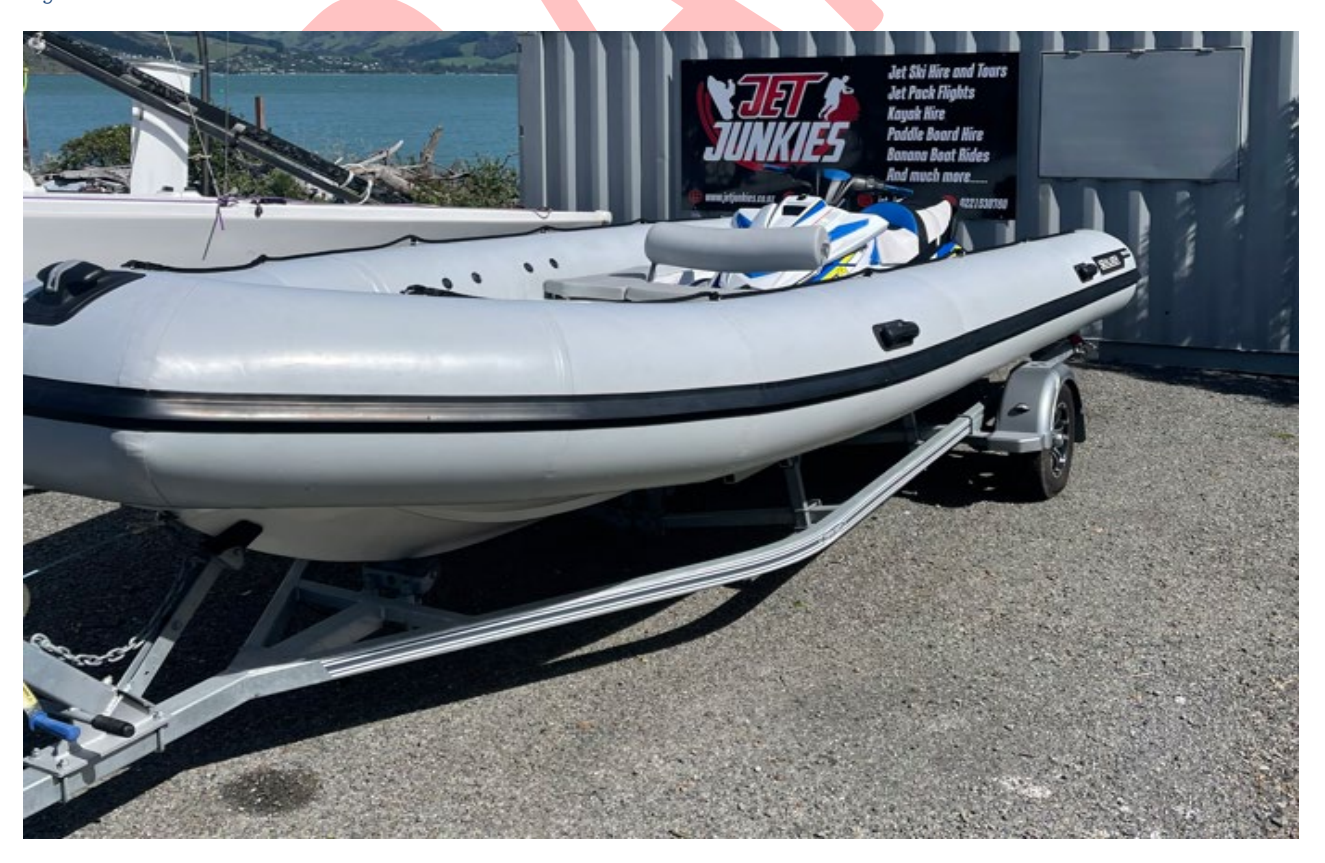
Figure 2 Front side view of Sealver with Jet Ski