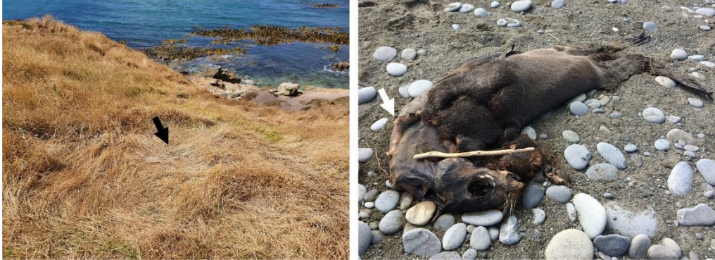
Sampling will occur from resting locations or deceased individuals. Left , depressions in grass meadow (black arrow) left by kekeno resting at Shag Point (Waitaki district). Tufts of fur are sometimes found caught in the grass. Right , sub-adult kekeno corpse Cooper's Lagoon beach (Selwyn district) in moderate state of decomposition with tufts of fur peeling off skin (white arrow). (Photos courtesy of D. Harland).

Our plan is to collect samples in the first half of 2021 from kekeno that have died of natural causes and washed up on the beach, or from scratched off tufts from grooming. This is not an uncommon occurrence in areas where kekeno aggregate and we have previously identified a few locations where we have previously noted dead seals or nest areas – Shag Point (Waitaki district), Tauranga Bay (Buller district), and beaches around Okuru, which is adjacent to the Open Bay Islands (Westland district).