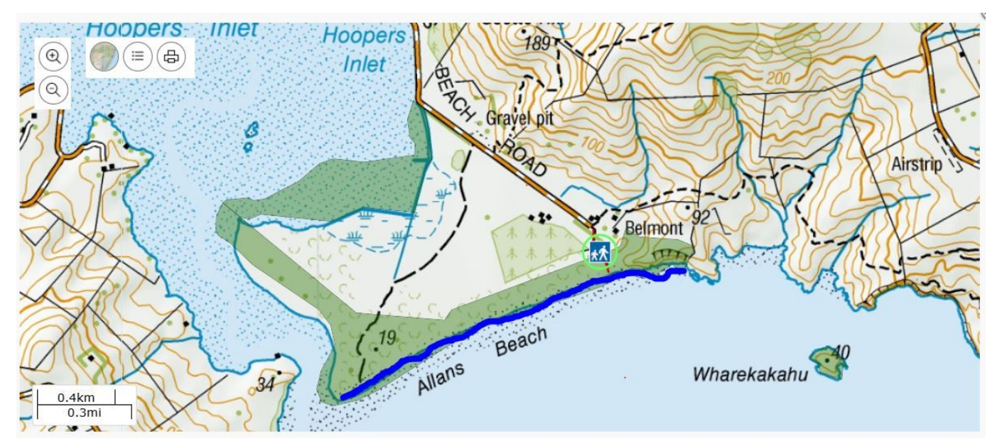
Key: Blue = Beach/route to view mammals. Green shaded area is Public Conservation Area.