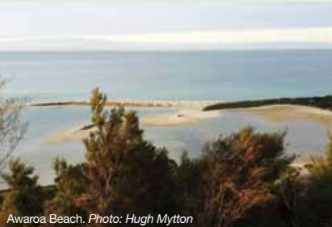
Awaroa Beach.

40 mins one way Awaroa Beach is famous in New Zealand for having been bought through a crowd-funding campaign to enable it to become public national park land.