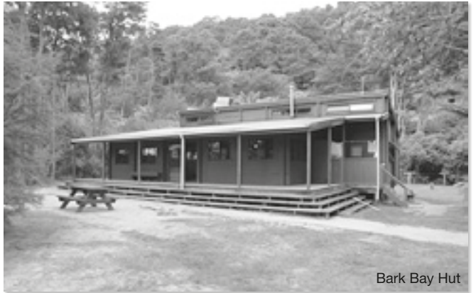
Bark Bay Hut