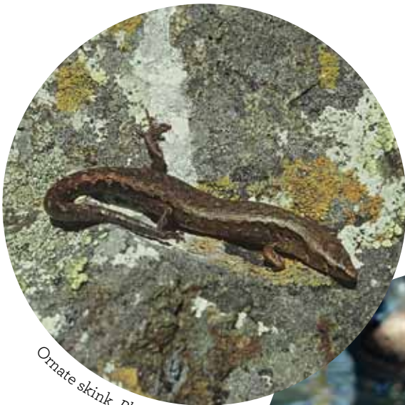
Ornate skink.

Visit www.doc.govt.nz for more information.