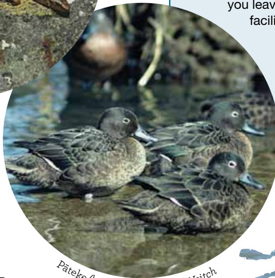
Pāteke/brown teal.