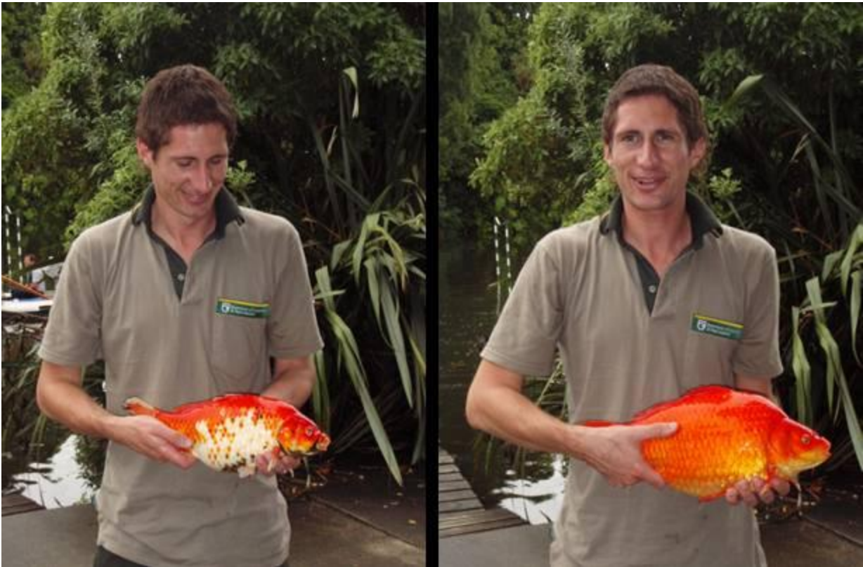
Figure 4: Examples of the large (>300 mm FL), highly coloured goldfish which have been mistaken for koi carp by the public in the Hokowhitu Lagoon, Palmerston North.