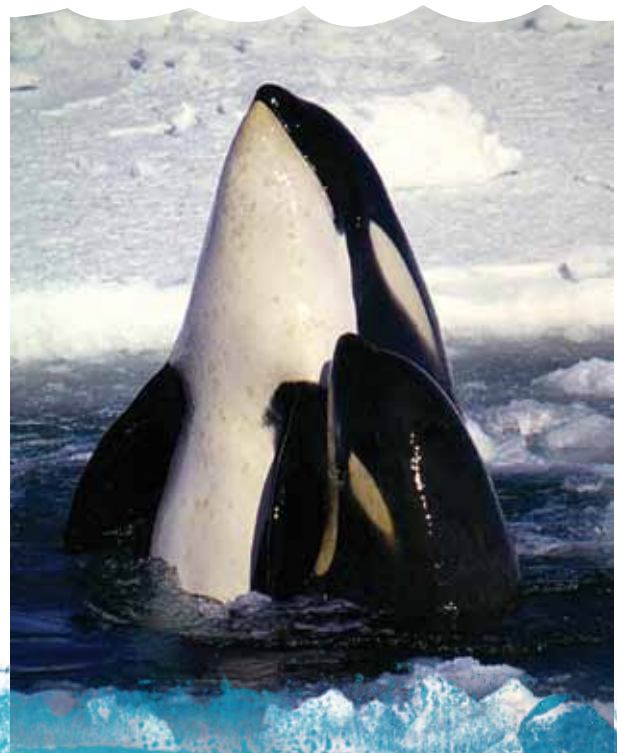
Orca whales spyhopping in the Ross Sea, Antarctica.

Pods of orcas are known to venture into Wellington Harbour throughout Spring and Summer looking for a unique food source (orcas in other parts of the world aren't known to do this), but it is rare for them to stick around. They dig the muddy sea bottom for stingrays and are often seen herding them into shallow water around Oriental Parade, Frank Kitts Park and The Lagoon. Passers-by have even watched as one stingray made a frantic leap for safety onto nearby rocks, later to be assisted back into the water by a nearby observer. Orcas are also often seen exploring the northern end of the harbour and the Kapiti Coast.