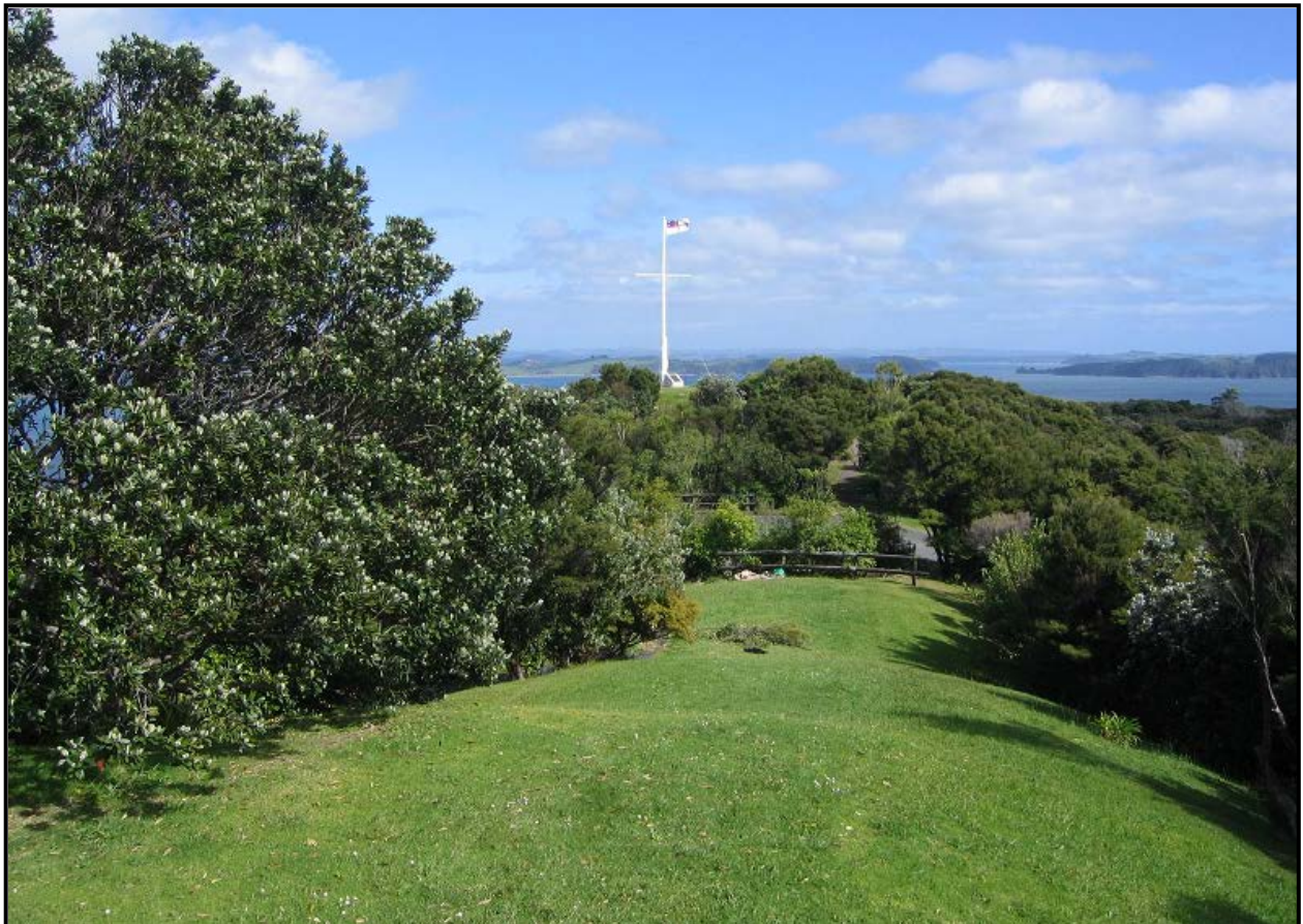
Appendix 2: Flagstaff today taken from the south eastern knoll where the sundial is situated and the possible location of the first two flagstaffs. Facing south, terraces can be seen running down the slope