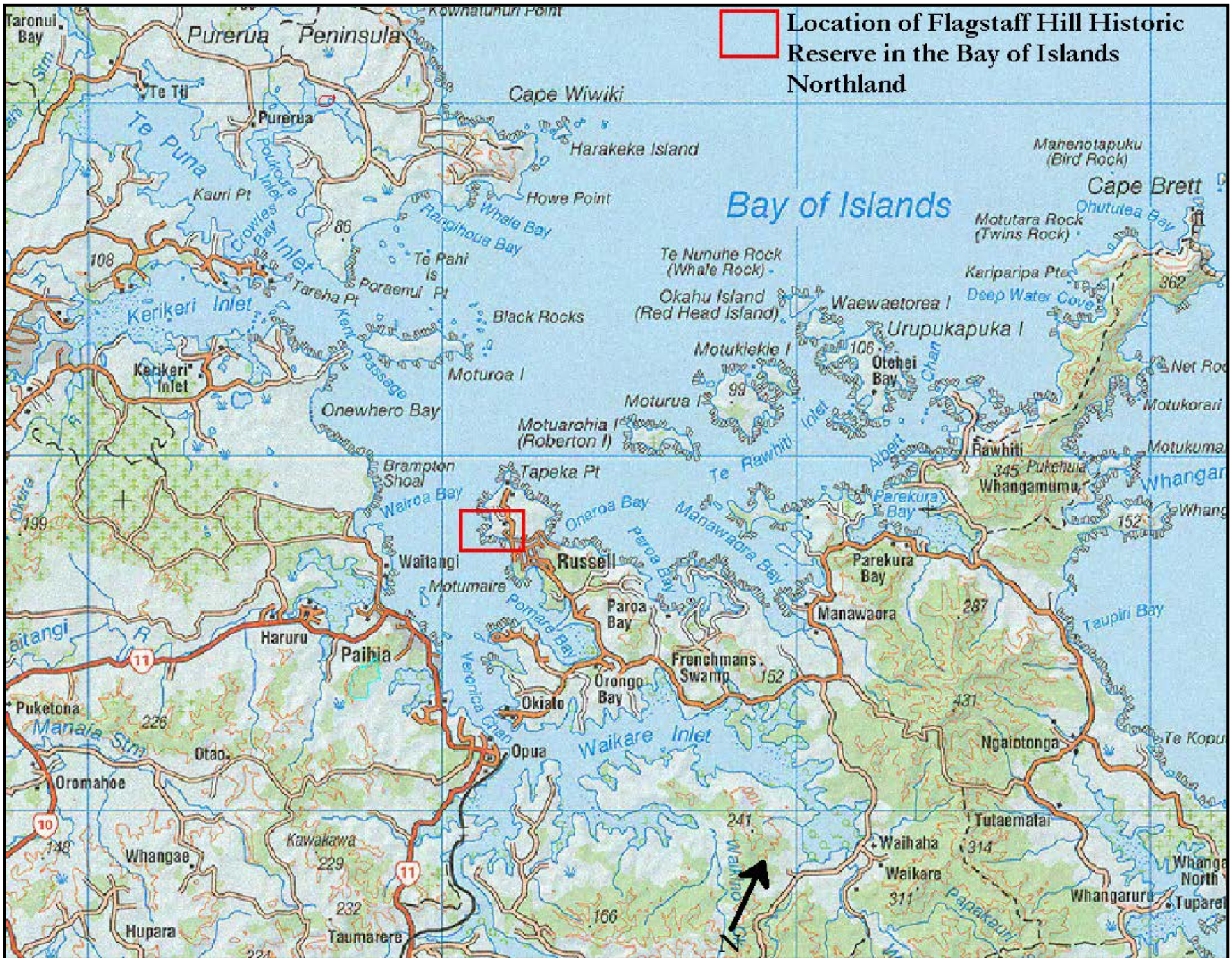
Appendix 1: Location of the Flagstaff Hill Historic Reserve within the Bay of Islands (arcreader)