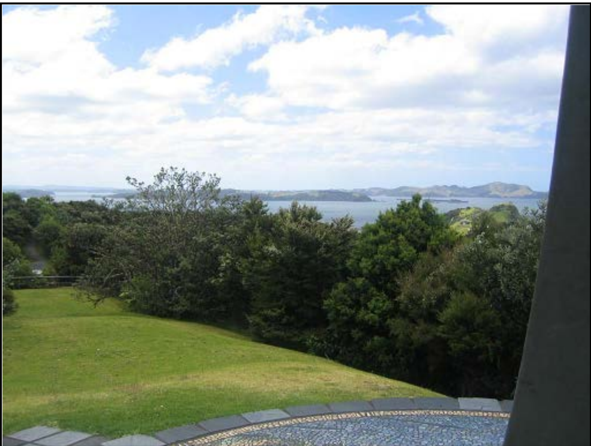
Appendix 3: Taken from the south east knoll (Titores Mount) with part of the sundial and the Purerua Peninsula in the background (DoC).