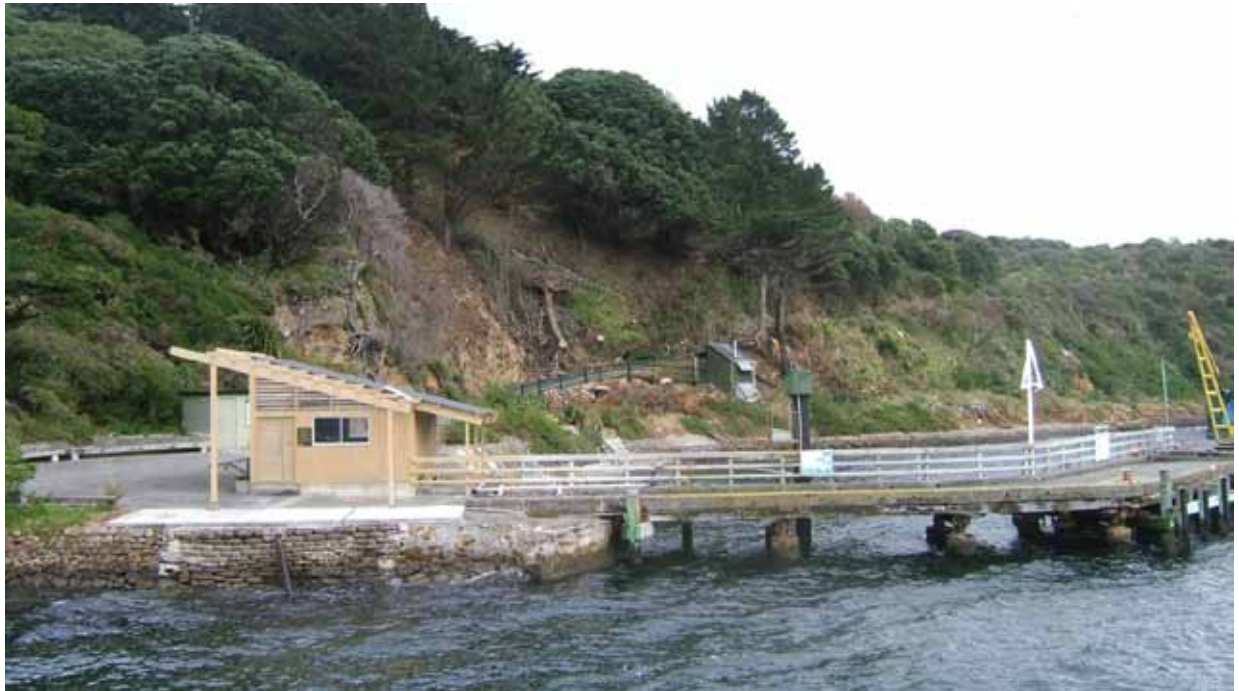
Current entry point to Mātiu/Somes island with Whare Kiore/bag checkpoint and wharf.