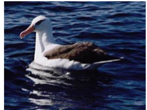
Adult Black-browed Mollymawk

Compared to Black-backed Gulls they are larger, with much longer and narrower wings. In flight, the gulls flap almost constantly, whereas the albatross will glide most of the time.