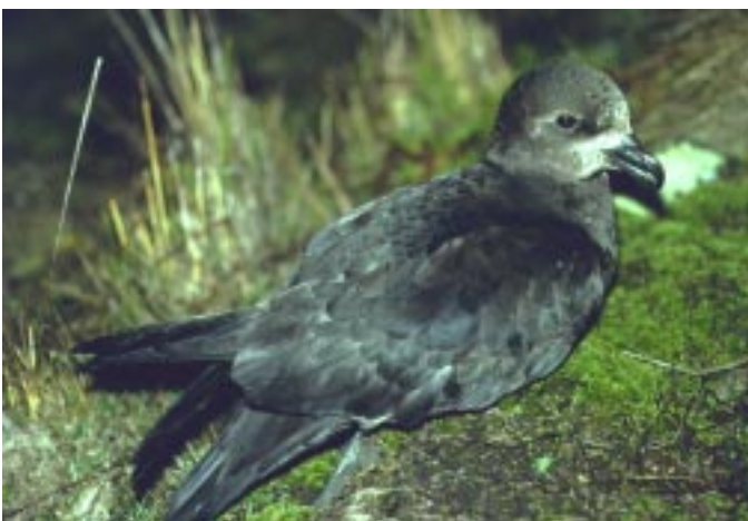
Grey-faced Petrel