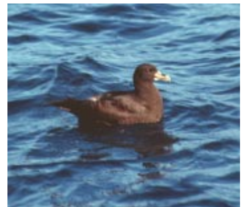
White-chinned Petrel

The most common muttonbird you will be seeing during the winter months will probably be the Grey-faced Petrel, which, as you can see in this photograph, has a distinctive grey face. These birds tend to be shyer than Flesh-footed Shearwaters, and will generally stay quite a way from the boat during setting or hauling, but they sometimes come in for a closer look.