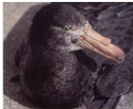
NORTHERN GIANT PETREL