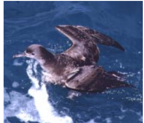
Sooty Shearwater