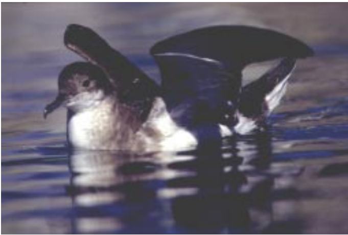
Fluttering Shearwater

every year. So if you ever thought that muttonbirds were more common in summer, and seem to mostly disappear in the winter, you are right! The only muttonbirds left once the Flesh-footed shearwaters disappear are less common, or more shy around fishing boats, like Black Petrels, Fluttering Shearwaters and Little Shearwaters.