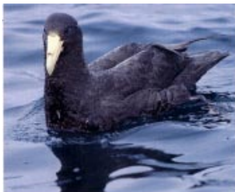
SOUTHERN GIANT PETREL