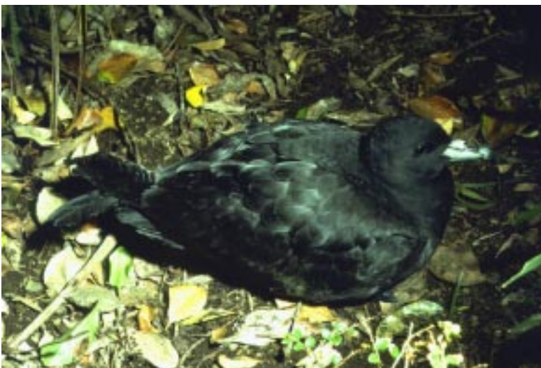
Black Petrel

The black petrel is a very good diver, so it is important that baits sink quickly behind the vessel and a good quality tori line is used to protect the bait. They feed on jewel squid which live along the shelf break zone from East Cape to North Cape. Black petrels feed during both the day and night.