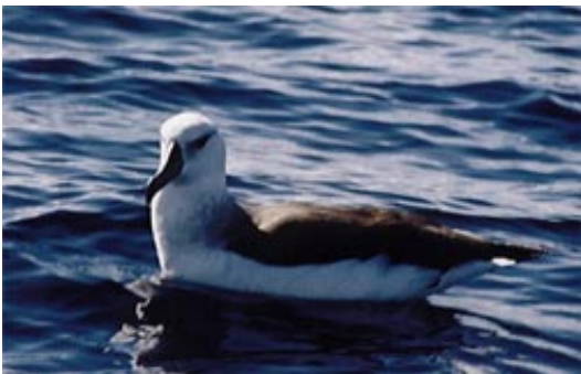
Juvenile Black-browed Mollymawk

The Black-browed Mollymawk is quite a misunderstood bird. Despite being one of the most common sights around fishing vessels, many people don't know much about them. They are one of our smallest albatrosses (yes they are albatrosses, mollymawk is the name given to the smaller species) and this has led to some confusion between similar looking birds, such as Black-backed Gulls, and even Australian Gannets. What makes the situation even more complicated is the fact that the young ones and the old ones look different anyway!