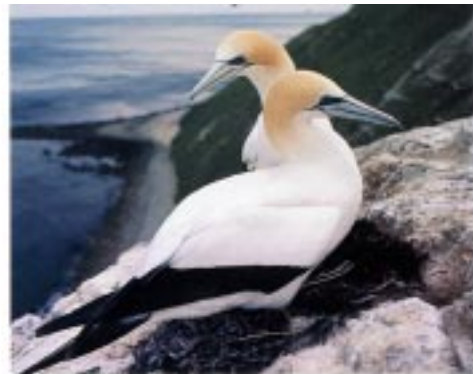
AUSTRALASIAN GANNET (takepe)