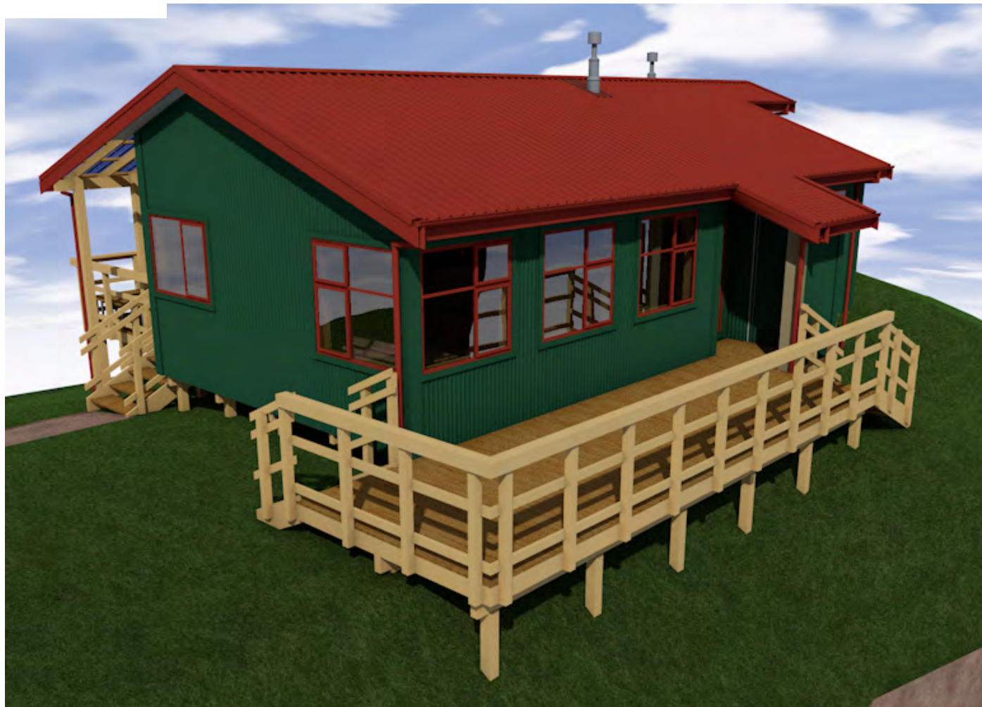
1602 Pororari Hut 3D View 2 (Green)

J:\Clients CAD\1602 Pike huts\1602 Drawing Documents\Pororari Hut\1602 Pike River Huts Pororari.pln