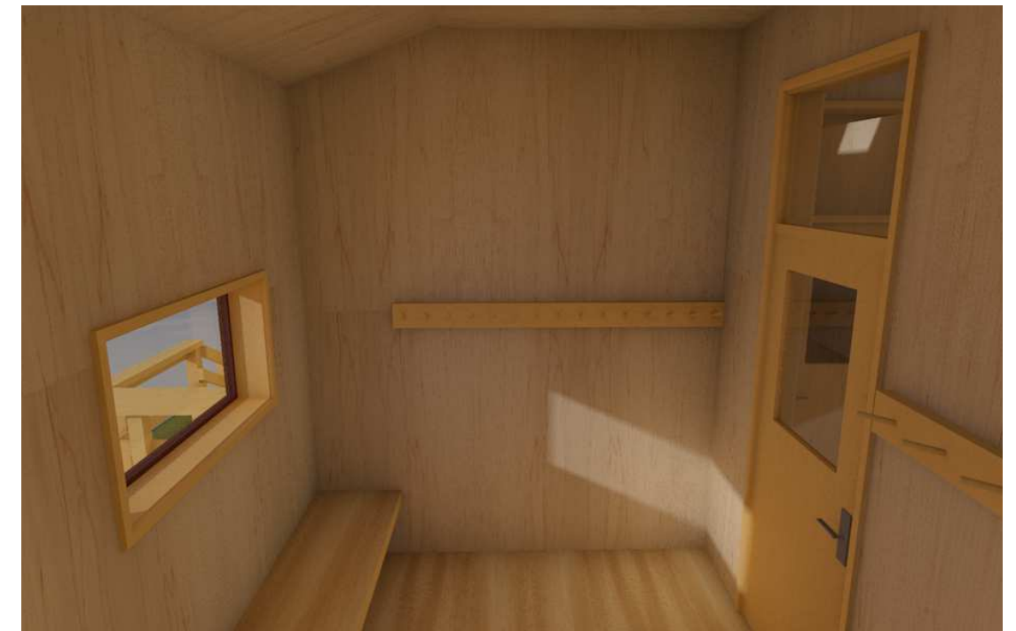
1602 Pororari Hut Interior 3D View 3