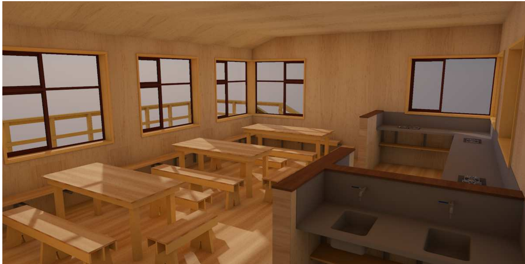
1602 Pororari Hut Interior 3D View 1