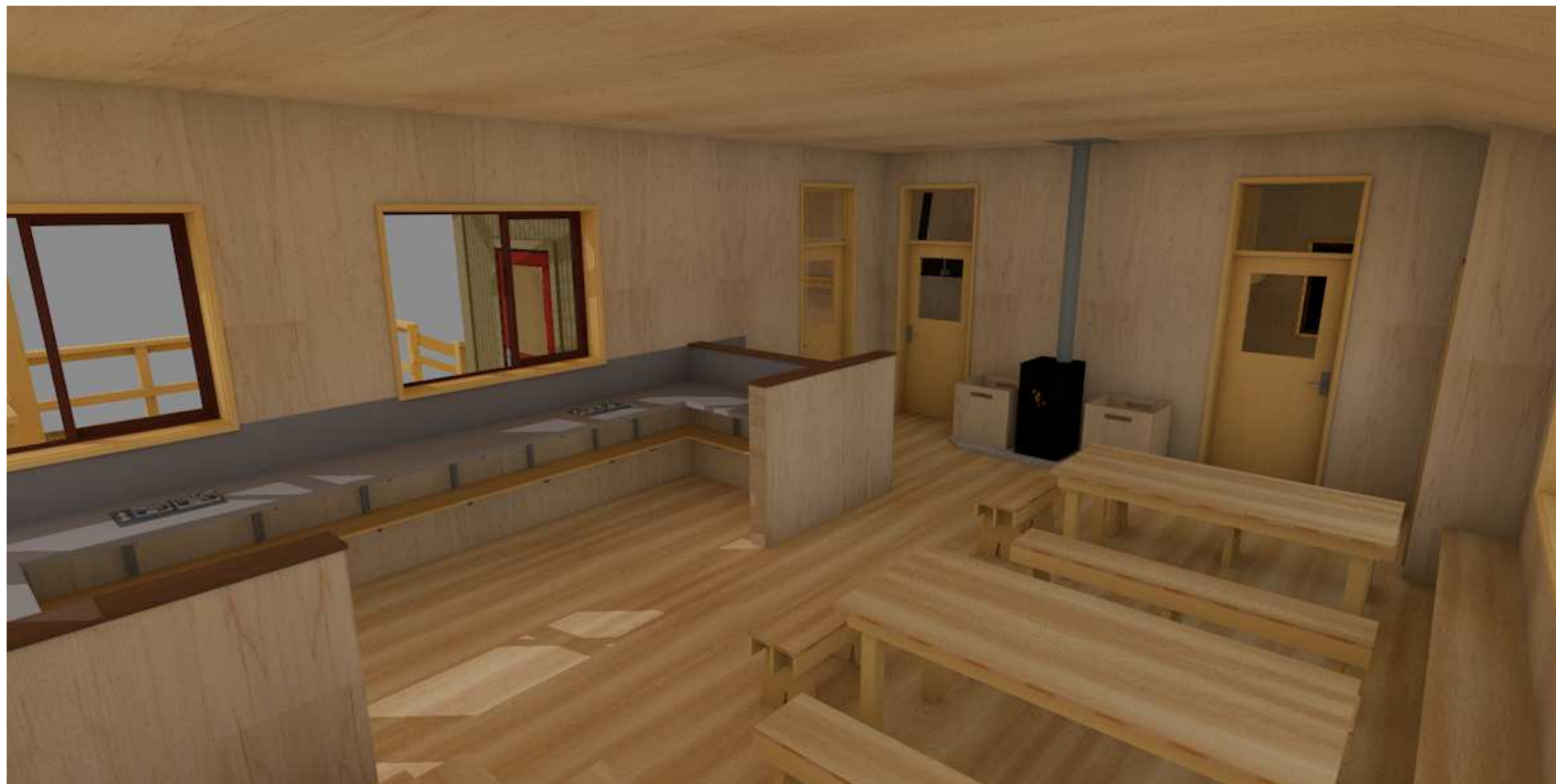
1602 Pororari Hut Interior 3D View 2

J:\Clients\CAD\1602 Pike huts\1602 Drawing Documents\Pororari Hut\1602 Pike River Huts Pororari.pln