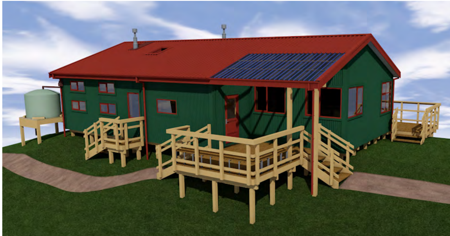
1602 Pororari Hut 3D View 1 (Green)