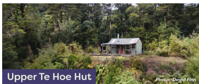
Upper Te Hoe Hut

Location: NZTopo50 map sheet BG39; E1927630, N5697920