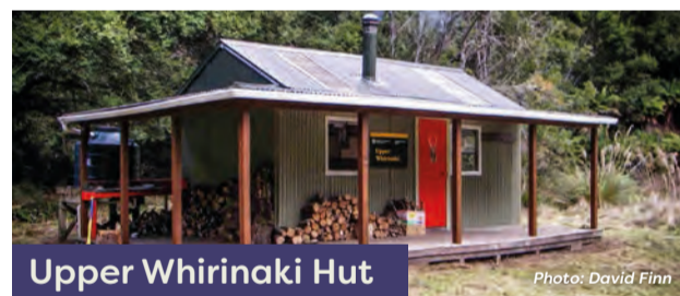
Upper Whirinaki Hut

Access: 5 hr from River Road car park; 3 hr from Plateau car park Location: NZ Topo50 map sheet BG38; E1917384, N5702317