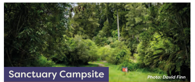
Sanctuary Campsite

Location: NZTopo50 map sheet BG38; E1922898, N5694428