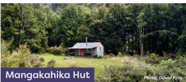
Mangakahika Hut

Location: NZTopo50 map sheet BH39; E1926810, N5691255