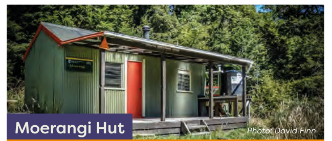
Moerangi Hut

A popular overnight trip from Whirinaki or as part of a circuit including Skips Hut (Whangatawhia) and Rogers (Te Wairoa) Hut. A good hut where you can listen for kiwi calling at night.