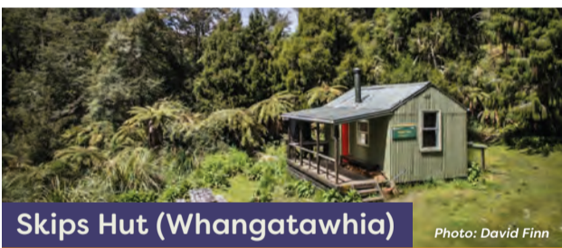
Skips Hut (Whangatawhia)

Conveniently located 7 km from Okahu Road end, Skips Hut has beautiful views of the podocarp and beech forests. It is an easy destination to reach on Friday nights for an early start the next day.