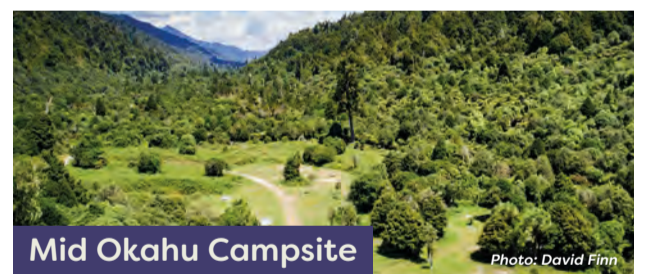
Mid Okahu Campsite

Location: NZTopo50 map sheet BG39; E1924363, N5713773