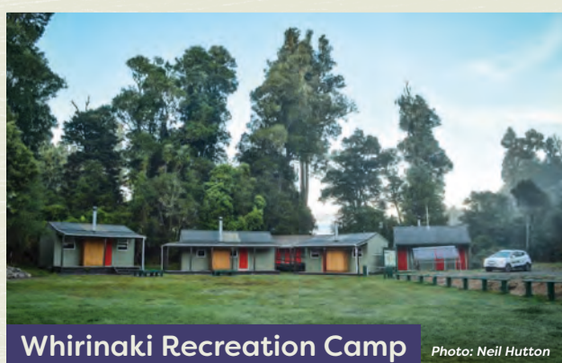
Whirinaki Recreation Camp

Location: NZTopo50 map sheet BG39; E1934169, N5719380