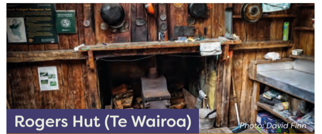
Rogers Hut (Te Wairoa)

Location: NZTopo50 map sheet BG38; E1923632, N5704619