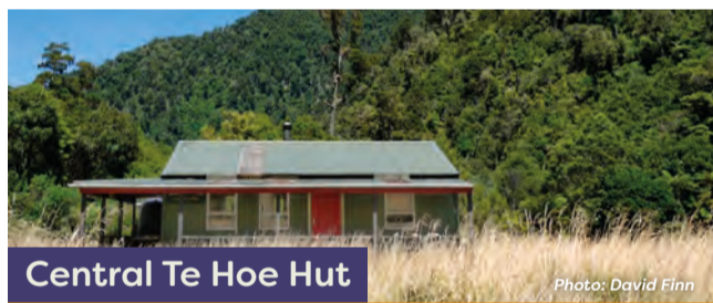
Central Te Hoe Hut

Location: NZTopo50 map sheet BG39; E1930410, N5707370