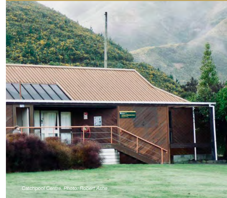
Catchpool Centre.

With two meeting rooms, a wood burner, projector, barbecue, kitchen facilities, tables, chairs, whiteboards and a large lawn area, it is ideal for corporate and social functions and education and community groups. No catering or overnight accommodation is provided.