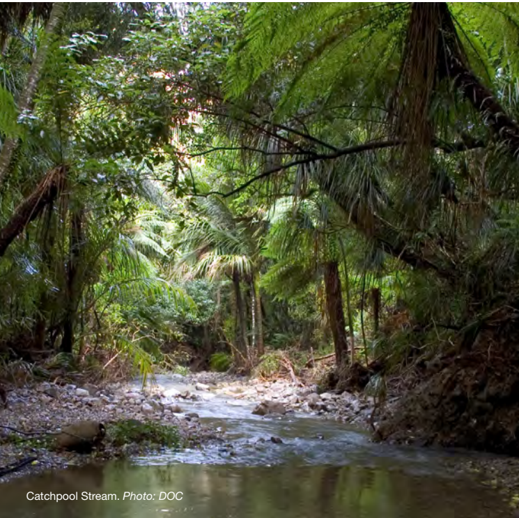
Catchpool Stream.

Wairaka and her lover left south Taranaki and travelled down the west coast while being pursued by her husband, Hau, who was the great grandson of Kupe, the explorer credited with the discovery of Aotearoa. Hau crossed the Te Awa Kairangi / Hutt River headwaters and saw the Remutaka Range, which looked like the remu (hem) of a kaitaka (cloak). Another tradition has Hau taking a rest – remu (buttocks), taka (to rest) – when he reached the top of the range, from where he saw a shining lake and named it Wairarapa (the flashing waters). Generations later in the early 1800s, waves of travellers migrated south from Taranaki, resulting in several iwi settling around the shores of Te Whanganui-ā-Tara / Wellington. These and preceding iwi would often venture into the valley to harvest karaka berries and eels. One of these iwi, Ngāti Ruanui of Te Aro pā, are direct descendants of Rongorongo.