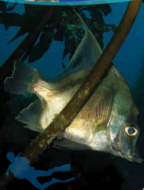
Long finned boar fish.

point to compare with other, less pristine, habitats.