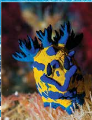
Tambja verconis, a brightly coloured nudibranch.