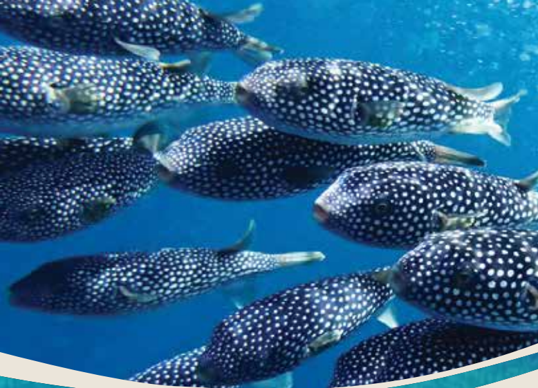
School of starry toad.