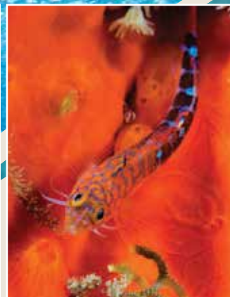
Blue dot triplefin.