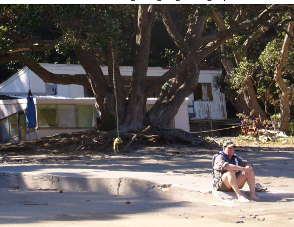
Time to relax after unloading and going through quarantine.

Tuhua Trust Board Tuhua Ph: 07 579 0580 Email: tuhuakaitiaki@gmail.com