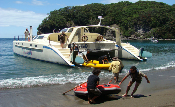
All luggage and gear must go through the quarantine shed on arrival.