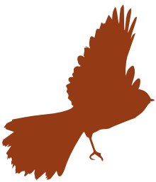
Fantail on Tiritiri Matangi Island.

Fantails eat invertebrates such as moths, flies, beetles and spiders. Small fruit is sometimes eaten.