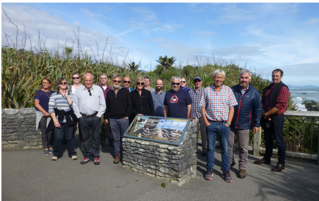
Authority members and Department staff on the Punakaiki Pancake Rocks and Blowholes Walk.

The Authority's standing agenda items with the Department at every meeting include: management planning updates, recategorisation of conservation land, the Director-General's report, and the New Zealand Biodiversity Strategy refresh. The Authority also discussed a range of issues of national long-term importance for public conservation.