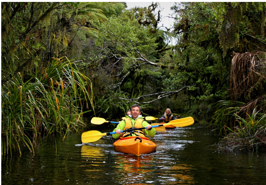
Kayaking, West Coast

The Authority's policies and principles can be viewed on its website.