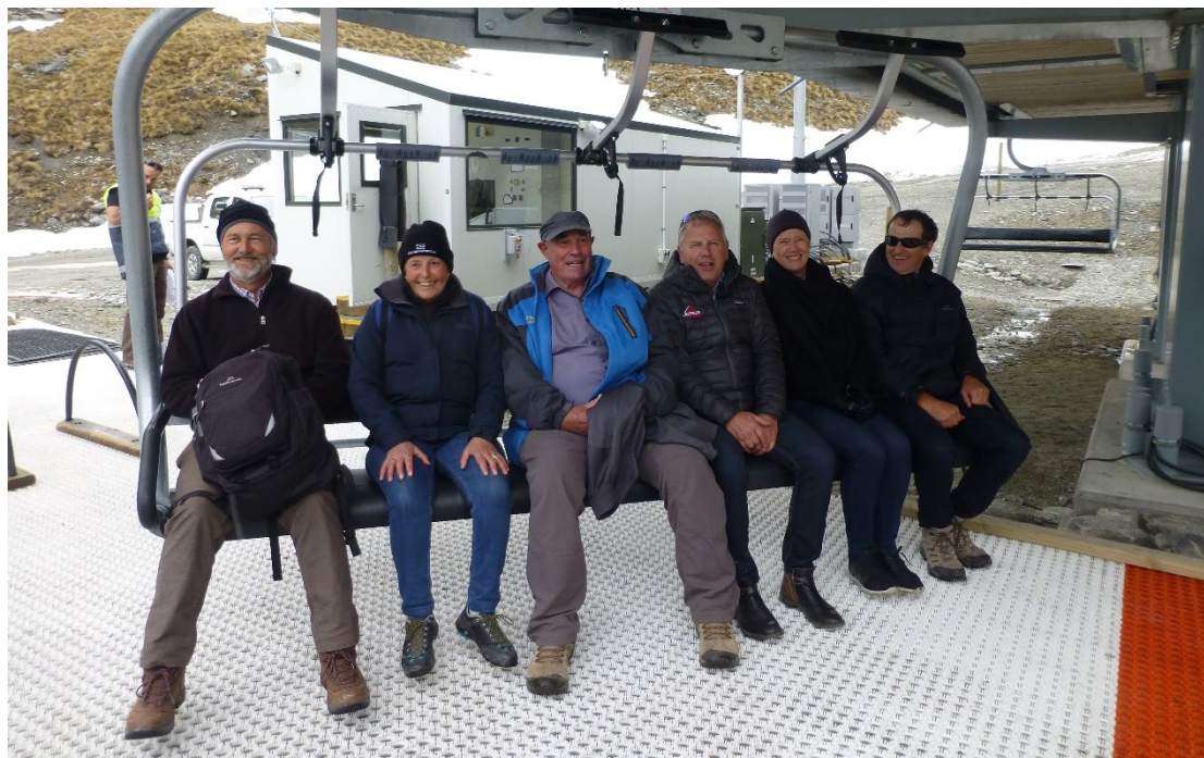
Authority and Otago Conservation Board members, with the Remarkables Ski Area Manager, at the Remarkables Ski Field.