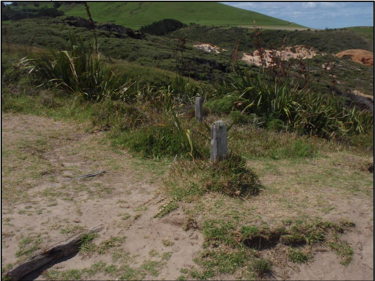
Appendix 5: Two vertical posts associated to the signal station (M Goddard 2010)