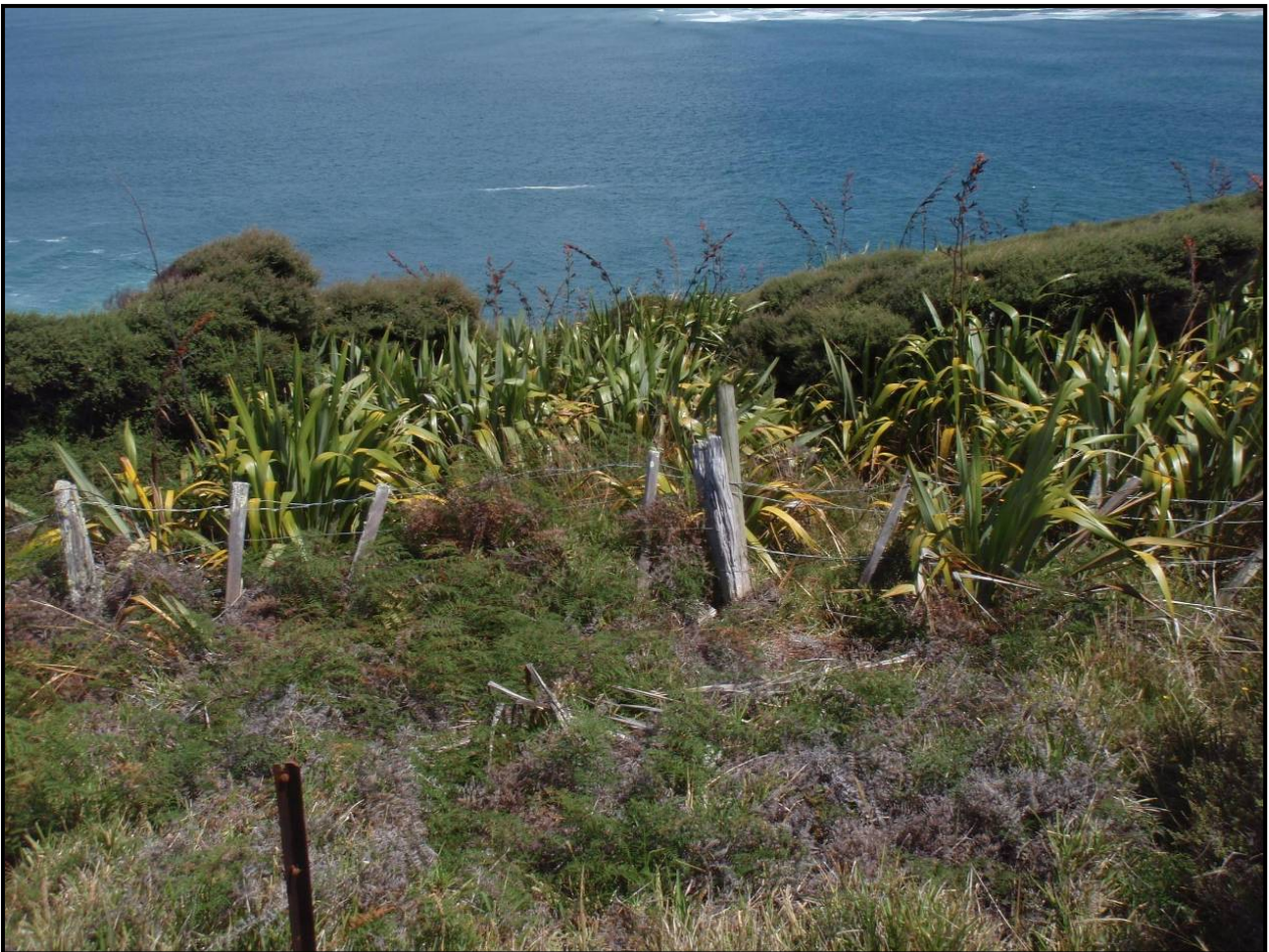
Appendix 4: Part of the original split post and batten fence that enclosed the signal station (M Goddard 2010).