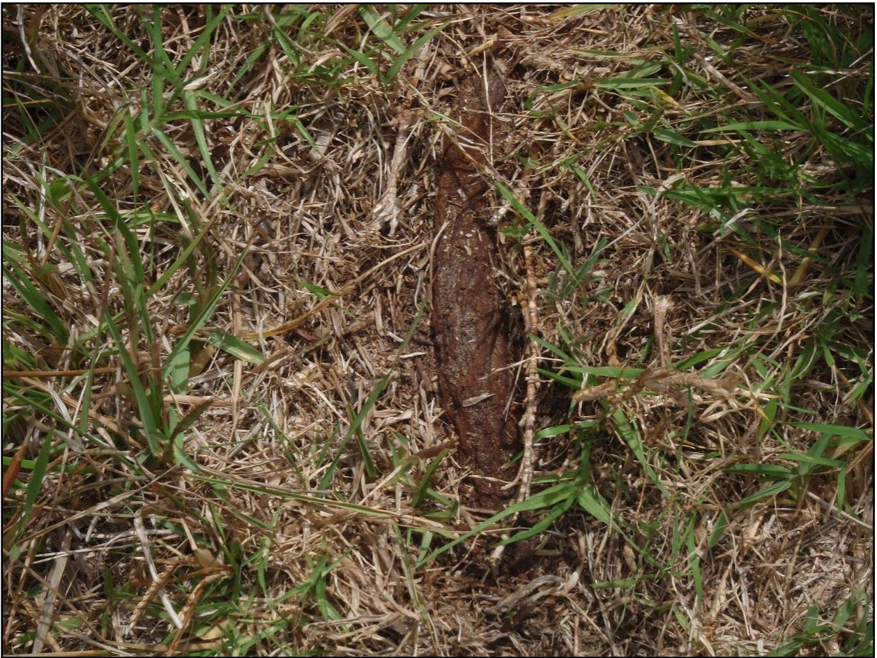
Appendix 6: Metal cable located on the headland tip