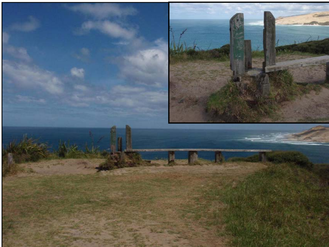
Figure 2: The remains of the signal station as seen today with inset of concrete mast base of the flagpole and yard arm