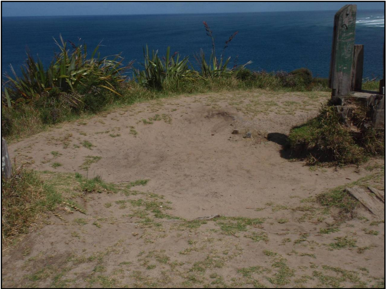
Appendix 2: Hollow where the signal station shed was located as seen in fig 1 (MGoddard 2010)