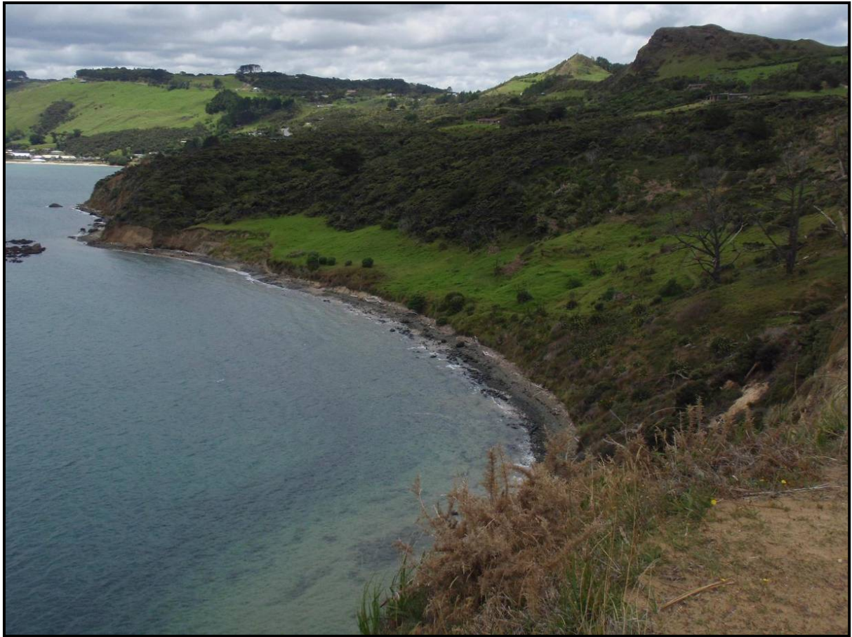
Appendix 8: Martins Bay where the houses of the signal station master and family, boast shed and slipway was located. Today only terraces of this occupation are visible taken facing east (M Goddard 2010)