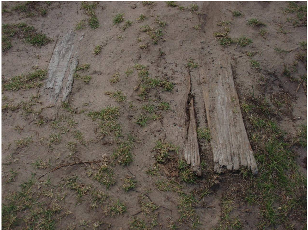
Appendix 3: Timber planks next to shed hollow likely to be associated to the shed (M Goddard 2010)