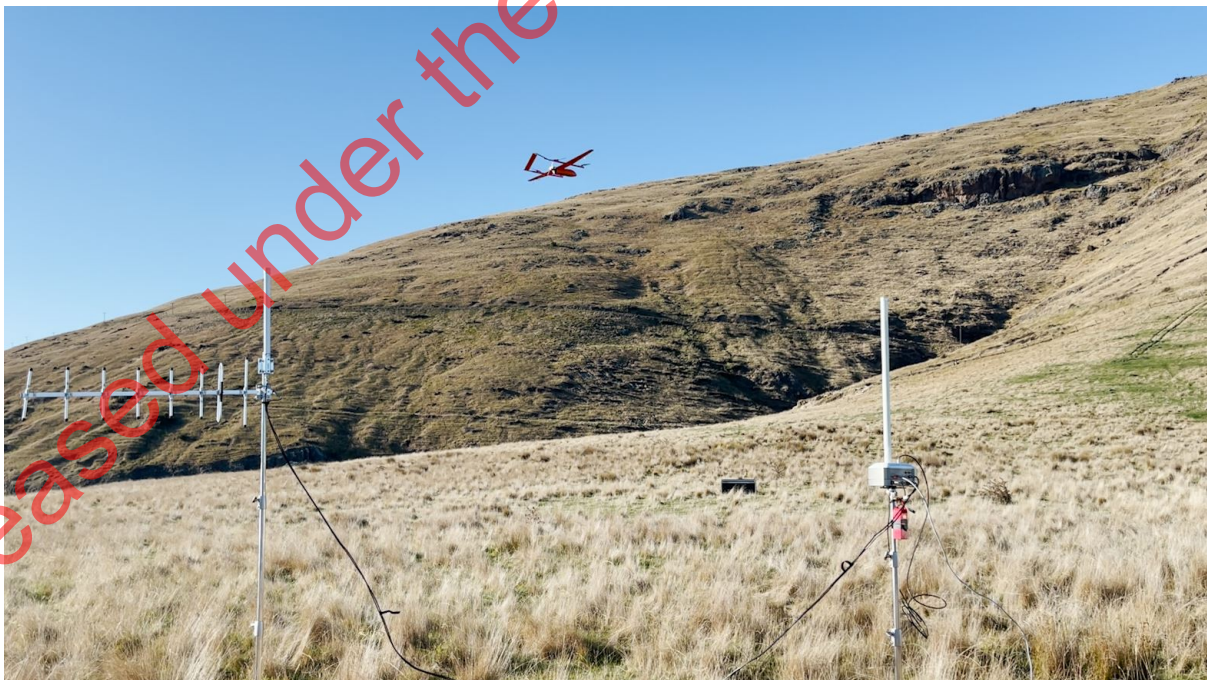
Figure 3 - Drone and Ground Control Station Equipment

Maui63 estimates that the whole area surveyed in approximately 90 minutes. The flight would generate approximately 1700 photos which could be analysed and uploaded to the marine management platform.