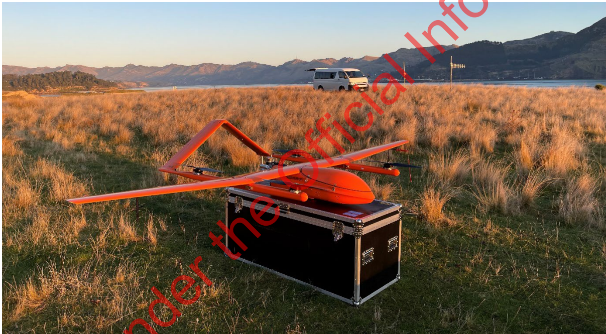
Figure 1 - Assembled Drone with Ground Control Station

Both flights took place from a site off Camp Bay road, on the southern side of the harbour. The site was accessible by vehicle and afforded a good view of the entire harbour. Figure 1 shows the assembled drone with the ground control station set up in the vehicle behind.