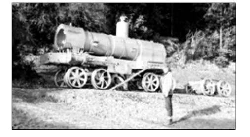
Figure 14. The Davidson Locomotive before restoration.

The Davidson Locomotive (Fig. 14) is thought to be the only surviving example of a locally built (i.e. at Hokitika) steam locomotive that was used on bush railways near Greymouth. Like the Mahinapua Creek bridge, this was also refurbished by Gray Bros Engineering in Greymouth under Jim Staton's supervision. After