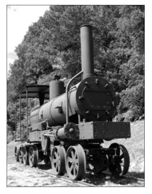
Figure 15. The refurbished Davidson Locomotive.

The Davidson Locomotive (Fig. 14) is thought to be the only surviving example of a locally built (i.e. at Hokitika) steam locomotive that was used on bush railways near Greymouth. Like the Mahinapua Creek bridge, this was also refurbished by Gray Bros Engineering in Greymouth under Jim Staton's supervision. After