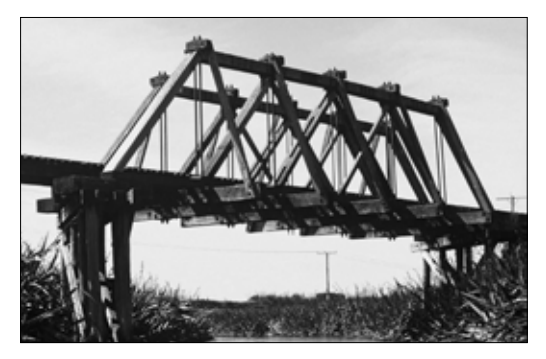
Figure 13. 'Howe Truss' bridge, West Coast.

This 'Howe Truss' bridge (Fig. 13) is located 5 km south of Hokitika and just 250 m from the sea. It was built in 1905 with steel bottom chords and iron truss rods, and was refurbished by the Department of Conservation (DOC) in April 2000. The following system was used for restoration: all exposed metalwork was abrasive blast cleaned to a 'near-white' finish (Sa 2½), primed with 75 \mu m of an epoxy zinc-rich primer, and top coated with 200 \mu m of an epoxy-mastic. The work was carried out by Gray Bros Engineering of Greymouth under the supervision of Jim Staton (then at Hokitika Area Office, DOC), using paint material and inspection services supplied by International Protective Coatings.