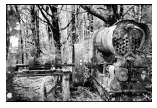
Figure 8. The patent Robey fixed engine.

Even more of a challenge for preservation is the Robey semi-portable underslung sawmill engine (Fig. 8), which used to provide power for the Golden Lead Creek Sawmill. This sawmill produced timber for the nearby coalmines and the Big River Quartz Mine. The engine's remote location (c. 24 km south of Reefton near the end of the Big River Road) has preserved it from scrap metal merchants and souvenir hunters.