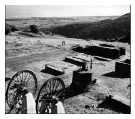
Figure 9. Cable wheels, located near the top of the Denniston Incline, West Coast.

The photo shown in Fig. 9 was taken in 2002 near the top of the Denniston Incline, with the Tasman Sea in the background. One of the advantages of the West Coast climate is that items such as the cable wheels on display are regularly rain-washed. Because they are exposed and have few crevices and low mass, they also dry out rapidly when mounted clear of contact with soil or wet vegetation.