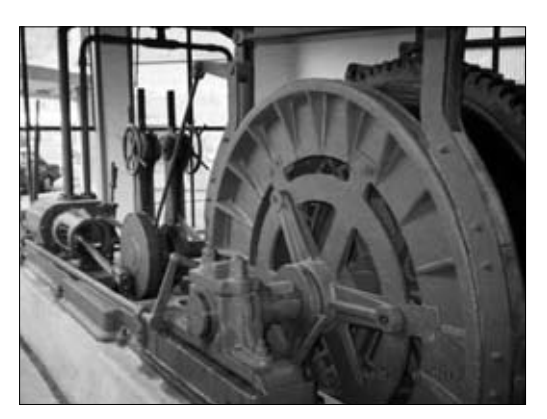
Figure 11. Restored winding engine, Reefton Visitor Centre, West Coast.

As an example of what can be done, Fig. 11 shows a restored winding engine, which is located in the Reefton Visitor Centre. It is now protected from the damp and salty West Coast environment (and damage by vandals) by a full enclosure and a simple protective coating system using alkyd paint.