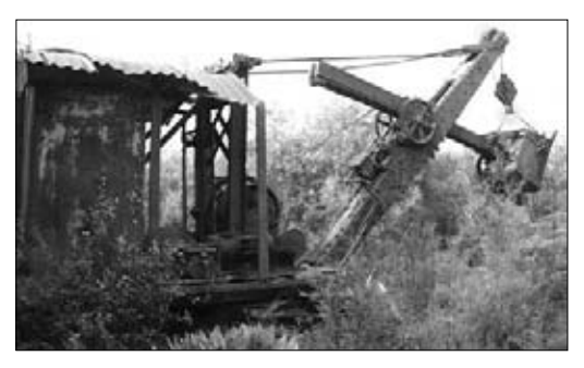
Figure 7. The Haupiri steam shovel, West Coast.

The Haupiri Steam Shovel is a current conservation project on the West Coast. Since the time of the photograph (Fig. 7), the surrounding vegetation has been removed and the steam shovel is now being treated each year with Ensis oil, which is a short-term preservative. This short-term measure will continue until funding for a longer term protective treatment is available.