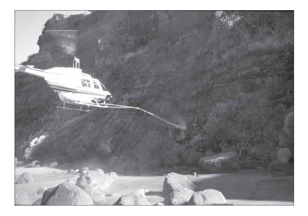
Figure 5. Helicopter spraying of Chilean rhubarb on a coastal cliff in Taranaki.

Control of Chilean rhubarb by whatever means is often complicated by the environment in which it grows—steep slopes are particularly challenging because it is difficult to find all the small plants. No information was found in the literature on the potential for biological control of Chilean rhubarb.