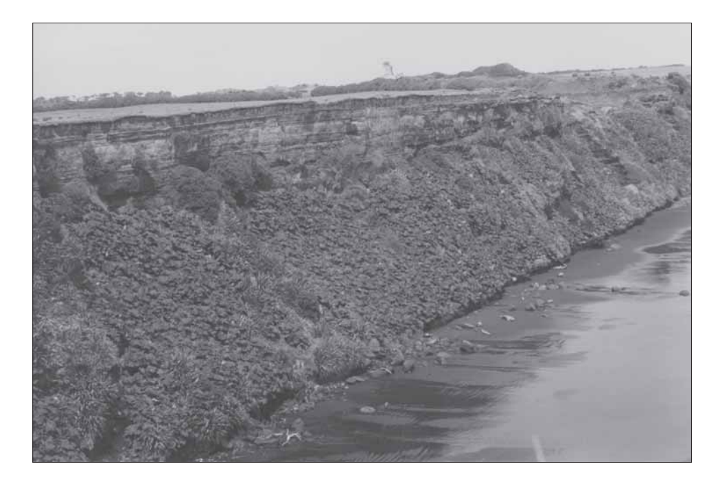
Figure 6. Chilean rhubarb dominating a sea cliff near Oeo, Taranaki Coast November 2001.

A range of herbicide trials on Chilean rhubarb since 2002 has produced variable results. Where it has been possible to get to Chilean rhubarb on foot, cutting the leaves and flower stalks against the rhizomes and applying 25% glyphosate by hand has been the most effective control method. Treated plants must be checked within a year to re-treat any surviving plants and to spray or remove seedlings. Seed appears to survive in the soil for no more than two years. Because of difficulties in reaching and working with Chilean rhubarb on very steep sites, control on such sites has proved difficult to achieve and expensive, exacerbated by problems in monitoring and undertaking the essential follow-up work on seedlings. To date, aerial spraying has had disappointing results and at the cost of non-target plants.