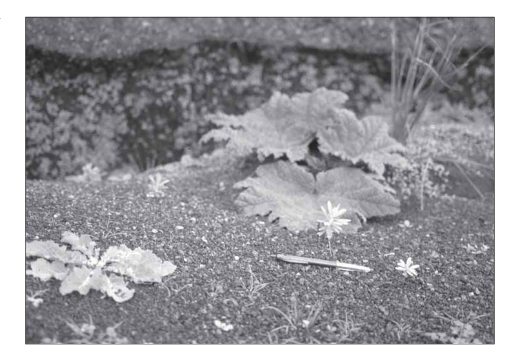
Figure 2. Seedlings of Chilean rhubarb (large leaves, middle ground) and threatened native plants Euphorbia glauca (small, narrow-leaved plant next to pen and elsewhere in photo) and Sonchus kirkii (lower left) colonising bare ground on a south Taranaki sea cliff. The Chilean rhubarb plant will quickly shade out the natives.

In Taranaki, the habitats occupied by Chilean rhubarb are unstable and it competes directly with native species for occupancy of new sites. This competition starts from the time the bare ground is first colonised (Fig. 2). We observed few other plants growing beneath dense patches of Chilean rhubarb. At one site there were a few grasses and etiolated seedlings of karamu ( Coprosma robusta ), and at two others there were straggling vines of pink bindweed ( Calystegia sepium ) plus clumps of black nightshade ( Solanum nigrum ) seedlings. It seems likely that Chilean rhubarb will persist at these sites, to the exclusion of native species.