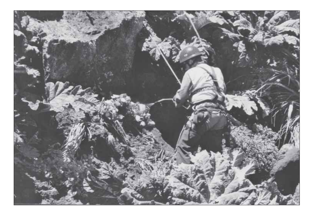
Figure 4. Abseiler spraying cut-back stalks and rhizomes of Chilean rhubarb.

It is essential to check all treated plants within a year; any surviving plants must be re-treated and all seedlings removed or sprayed.