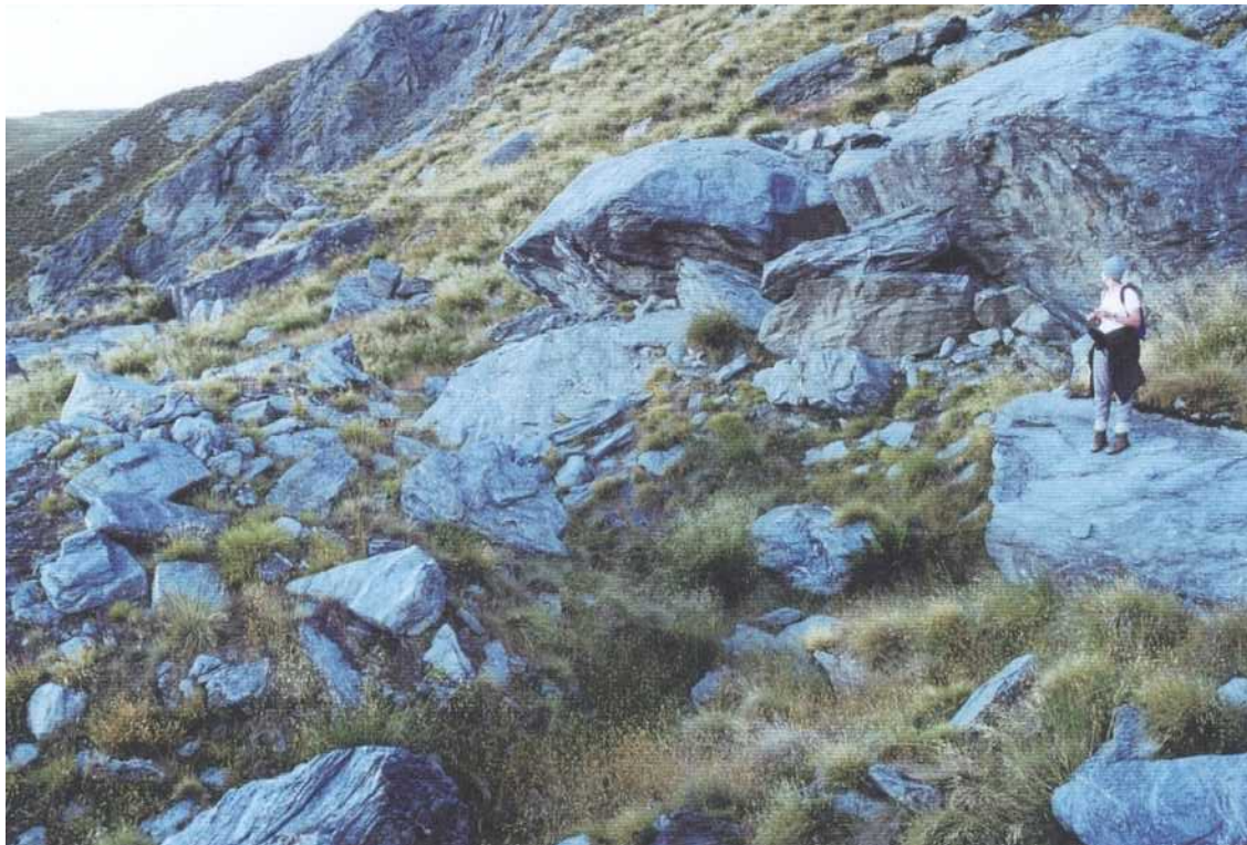
Figure 4: The boulder field underneath Mt Alpha where the majority of the Roys Peak geckos were found as they were active on large rocks at night.