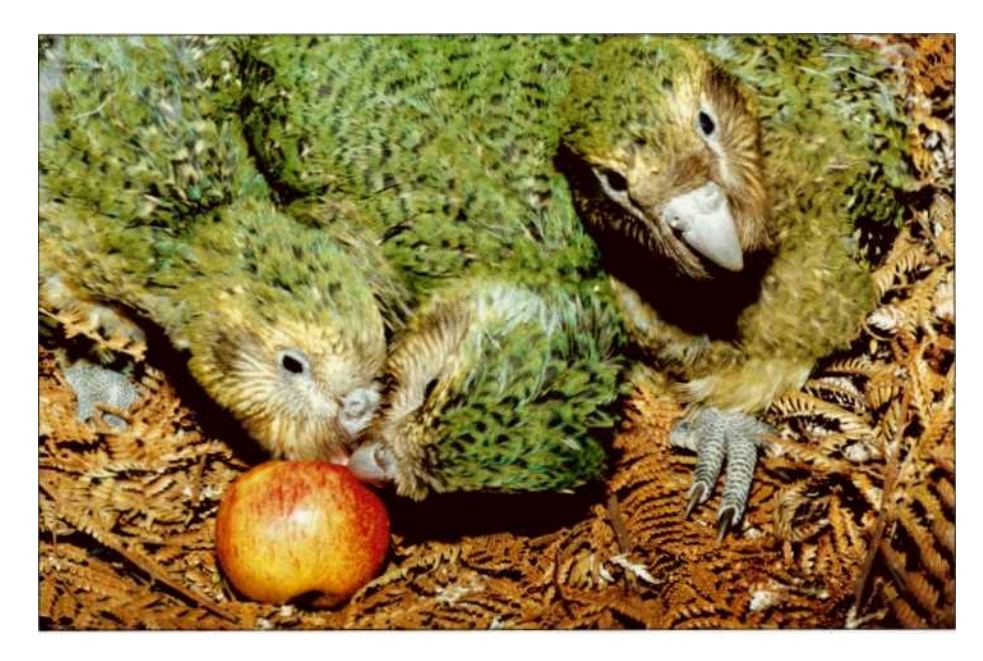
Three-month old fledglings, 1992.

Little is known of the diseases that kakapo suffer, but it is likely that they have been exposed to several new ones since the arrival of Europeans, poultry, cage birds and introduced European birds.