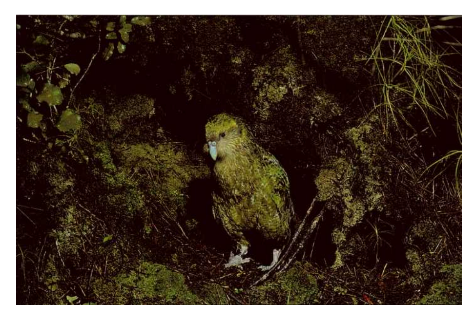
Female standing at nest entrance, Stewart Island, 1981.