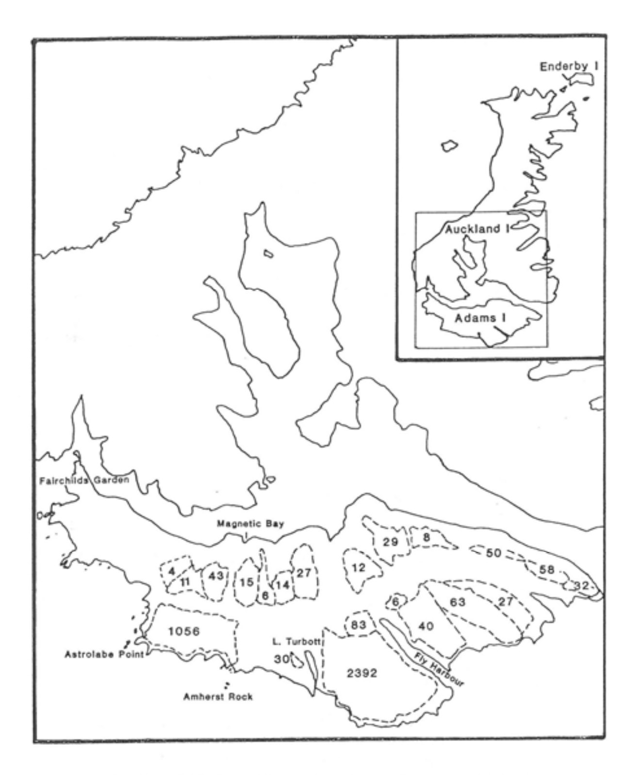
Figure 2: Numbers of Wandering Albatross (breeding pairs) on Adams Island, February 1991.