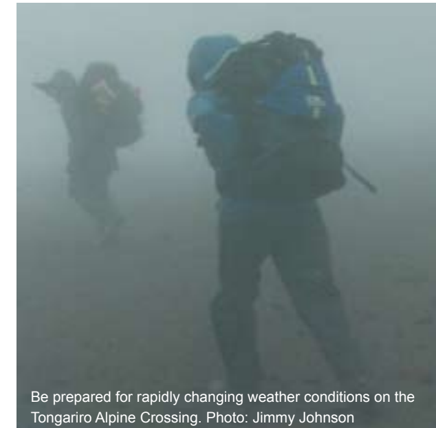
Be prepared for rapidly changing weather conditions on the Tongariro Alpine Crossing.