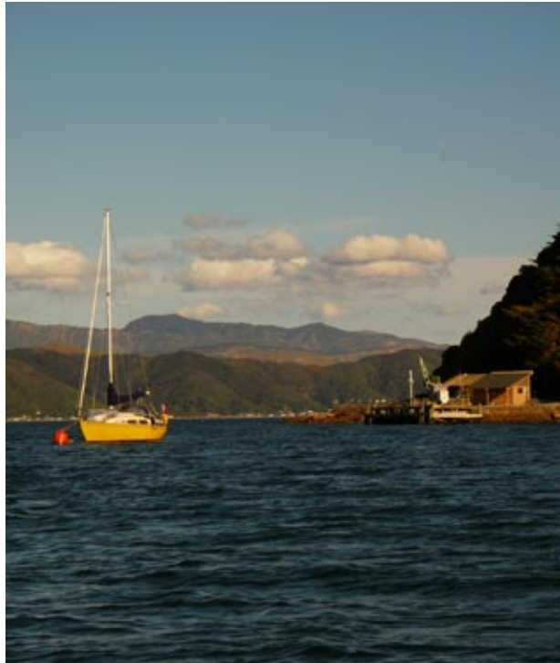
A yacht moored off Matiu/Somes Island.

Everything on the island is protected, nothing may be removed.