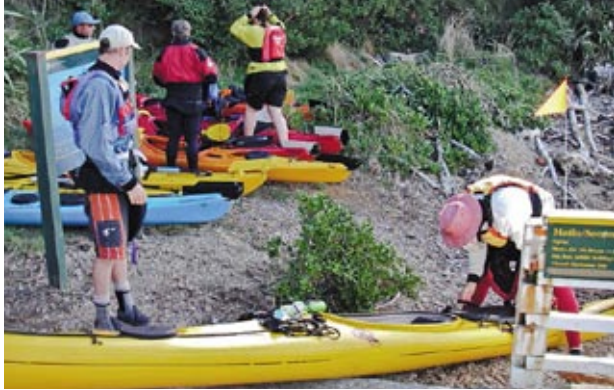
Kayakers' landing area.

The island is open daily between 8.30 a.m. and 5.00 p.m (except Christmas Day). The island may be closed to visitors at times of extreme fire danger.