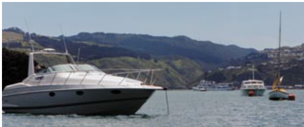
Boats moored off Matiu/Somes Island.