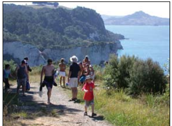
Visitors returning to the Cathedral Cove carpark after visiting the marine reserve..

There are several scenic walks on land adjacent to the reserve, including the Cathedral Cove track which gives access to Gemstone Bay, Stingray Bay, Mare's Leg and Cathedral Cove. Access to Cathedral Cove carpark is available at the western end of Hahei Beach and Te Pare Point Historic reserve is at the eastern end of Hahei Beach.