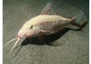
From top to bottom: Blue Maomao, Lord Howe Coralfish, Goat fish.