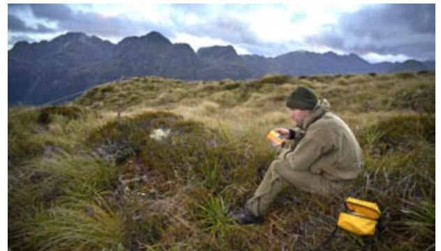
Using Mountain Radio service in the Glaisnock River valley.