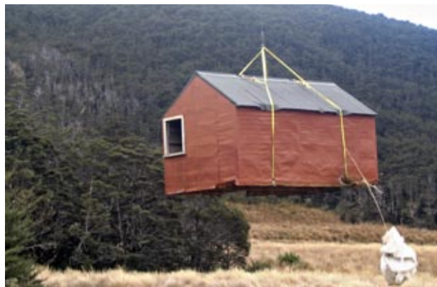
Huts move, bridges are washed out, track conditions change. Photo: Removal of Speargrass Hut by helicopter.

Facilities and services change—always check the latest information before you venture out