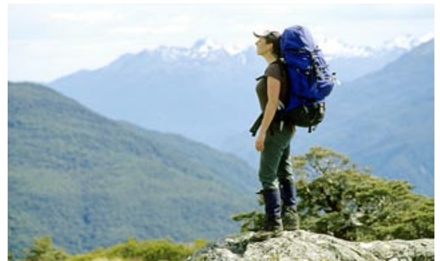
Having the right gear makes adventures more enjoyable.