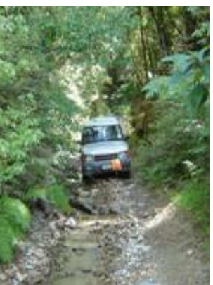
Remember that there are often other track users. Drive at a speed that will allow you to stop if a hazard arises. Photo: Napoleon Hill Rd, Malcolm Langly, nzadventures.co.nz