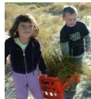
Children replanting sand dune grasses in Otago. Sand dunes and beaches are easily damaged by vehicles. Please avoid driving on beaches.

'Rock snout' or Didymo forms massive carpets that reduce water clarity. It affects every animal that uses the river, including you!