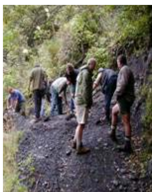
Getting involved in road maintenance. A 4WD club repairing a road.