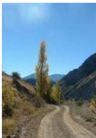
Enjoy the views and please stay on roads.