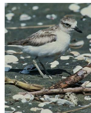
A NZ dotterel (critically endangered) near her nest. Her only defence is camouflage. Can you see her egg? Their nesting season is Sept – Feb, please avoid driving on beaches during this time.