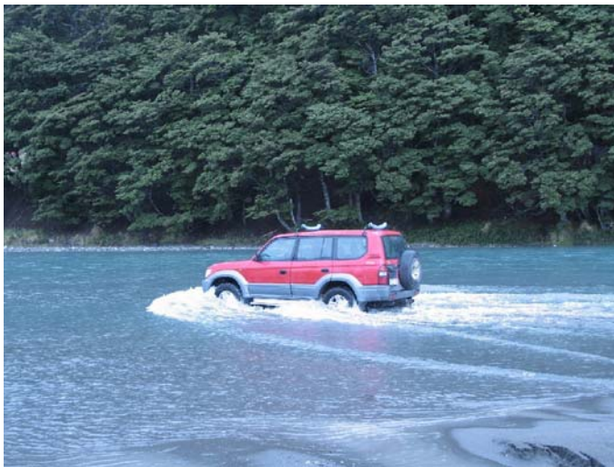
Cross rivers with care, use an existing ford and cross at a right angle to limit damage to the stream bank.