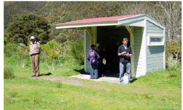
Left: Walkers make their way across Siberia Gully. Top right: Cycling on the Rimutaka Incline. Bottom right: Visitors at Cross Creek shelter