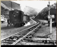
"Centre rail begins", Cross Creek.