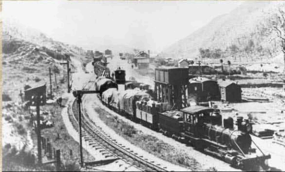
Cross Creek, 1899.