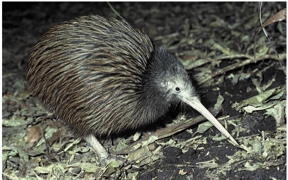
North Island brown kiwi.

Whangarei Area Office Department of Conservation PO Box 147 WHANGAREI 0140 Phone 09-4703360