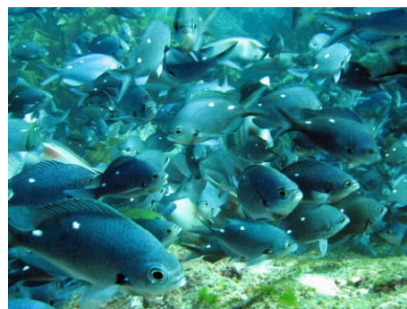
Demoiselles.

There is a CMS Public Forum where you can ask general questions about the strategy.