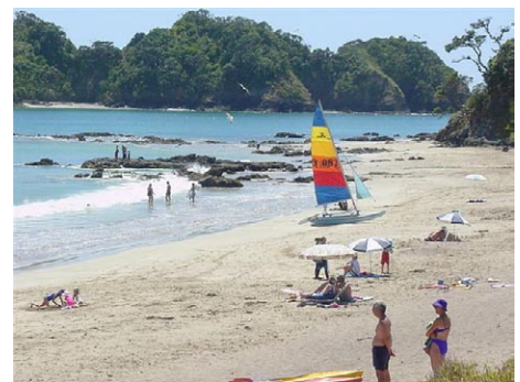
Otamure Bay.

Reviewing the Northland conservation management strategy (CMS) is different from other processes you might have been involved in. DOC and the Northland Conservation Board are gathering as much information from as many people as possible before anything new is written. With a few exceptions (explained below), the revised strategy will be developed from what you say. Then you can have a look at what DOC and the board thought you were saying to see if it's right. And when you have a say, DOC will let you know how it's been used in the revised CMS.