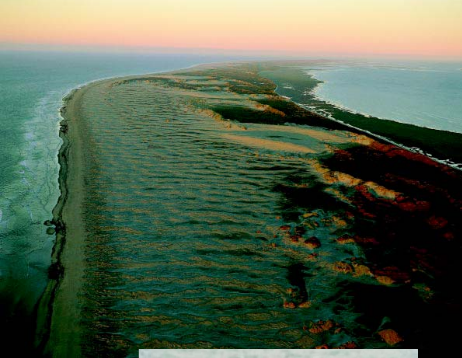
Farewell Spit at sunset. Craig Potton