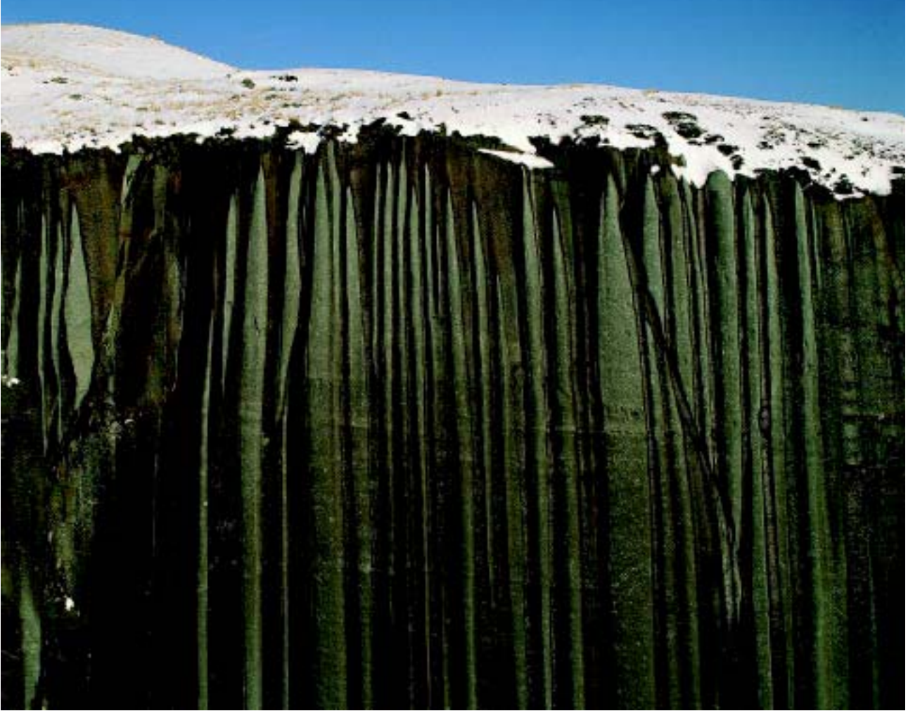
Fluted marble cliffs on Garibaldi Ridge, Kahurangi National Park. Craig Potton