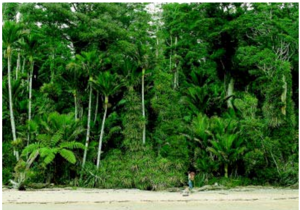
Coastal forest containing nikau palms, near mouth of Big River, Kahurangi National Park. Craig Potton