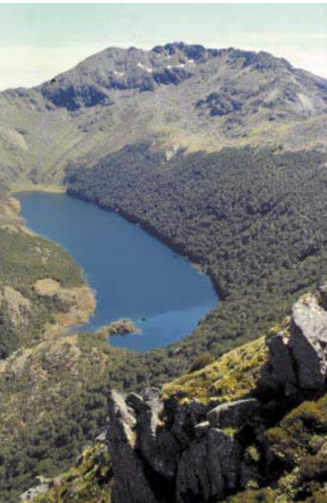
Island Lake, a cirque lake below Aorere Peak in the Tasman Mountains, Kahurangi National Park. This landscape is part of the Tasman Wilderness Area.