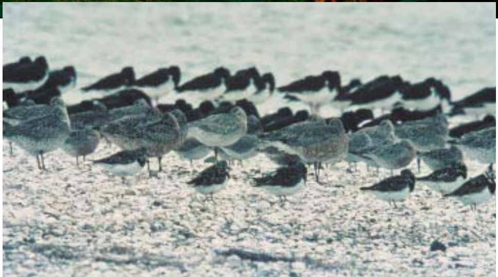
Turnstones, bar-tailed godwits, and South Island pied oystercatchers.