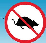
Rats / Mice