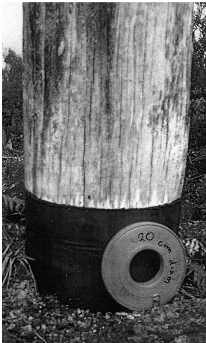
Fig. 19: Polegel bandage on powerpole, Kopu-Coroglen 10,000 kv line. Note vegetation growing in immediate vicinity, unharmed by Polegel.

Not all timbers entering the ground will necessarily need groundline protection. Piles driven into shingle riverbeds may be completely free from groundline rot. Piles in