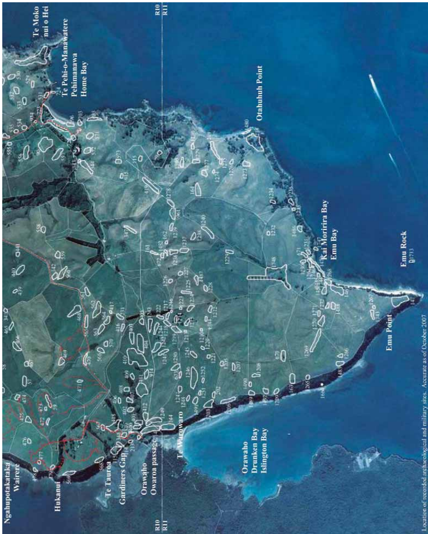
Location of recorded archaeological and military sites. Accurate as of October 2007