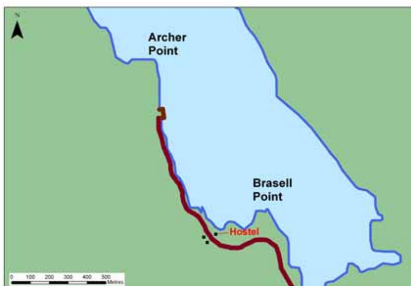
MAP 12A. DEEP COVE (PART 1 - OVERVIEW)